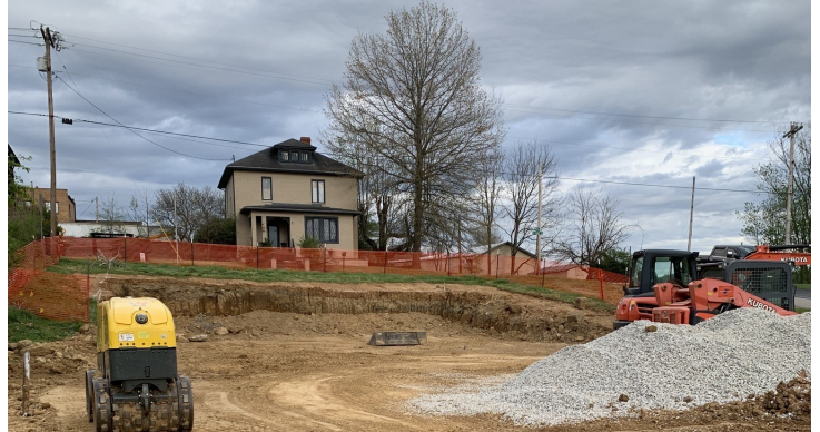
Construction begins for Harrisville Baptists' multipurpose building.

Spring association committees are meeting now to prepare for our annual meetings, which occur late summer and early fall. Prayers for them as officers are selected for the new church year.