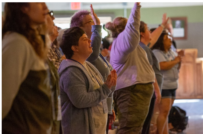
Enjoying a time of worship in Hylbert Hall.

We were thrilled to host ladies from Summersville Baptist Church to share about Ryan's Case for Smiles. This organization cuts, pins, irons, sews, launders, packages and delivers handmade, fun pillowcases to four different hospitals in WV that care for children.