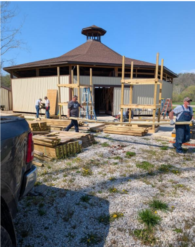
Beginning construction of the new playground at Parchment Valley.

As you visit Parchment Valley or Camp Cowen this summer, take time to notice the improvements and thank the many volunteers whose service helped make them possible.