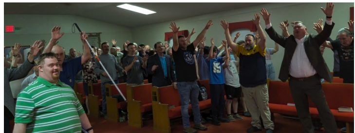
Tuesday night of the Holy Week services, Orient Hill Tabernacle was packed!

There are so many other examples of services in my area that were specially planned around Easter to proclaim the Good News of Jesus! I am so thankful for the soul-winning stations in the southeast region who continue to proclaim the Good News of the Gospel!