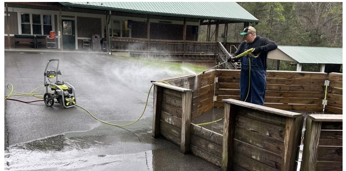
Pressure washing the GaGa Ball pit at Camp Cowen.