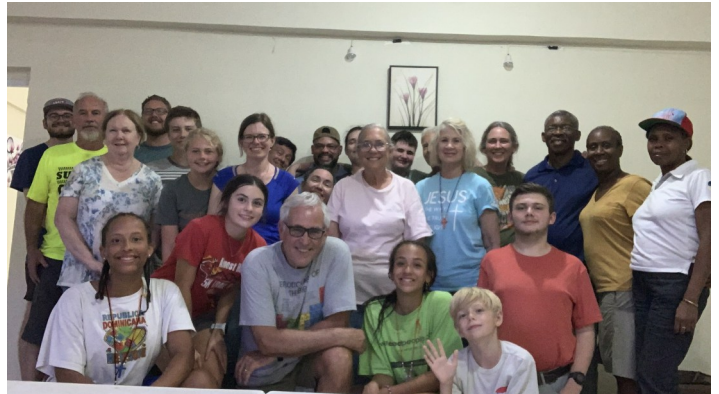
FBC Saint Albans Mission Team in the Dominican Republic last summer.