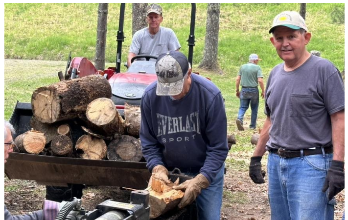
Splitting wood to prepare for campfires at Camp Cowen.