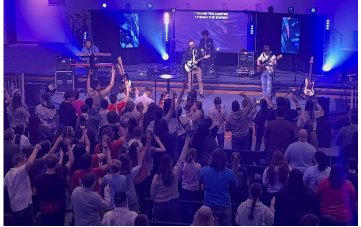
Render the Heats leading students in worship.