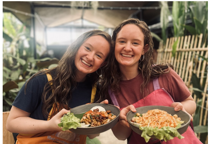
Highlight #4: Learning the Thai culture through working with people, discovering their land and eating their food.