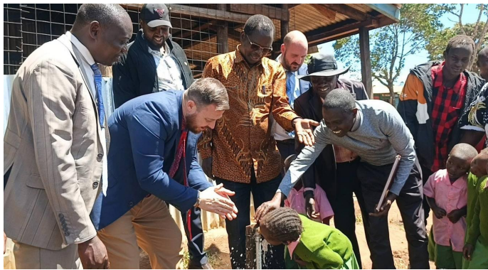
The first drink during the dedication of the Living Water project.

The WVBC's mission statement is "Doing Christ's Work Together." The most recent Kenya mission trip provided a powerful example of what that mission looks like in action.