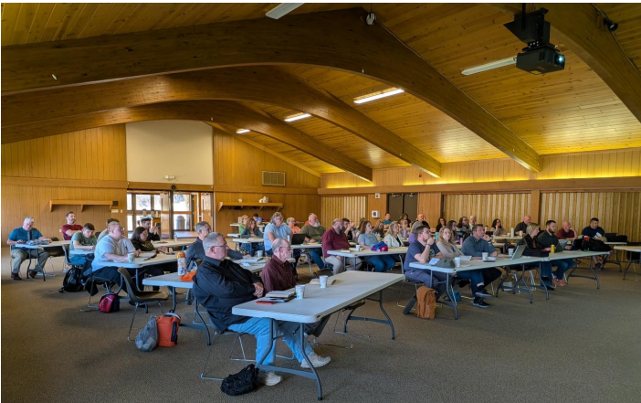
Attendees gathered in Hill Hall to learn about the books of Ezra and Nehemiah