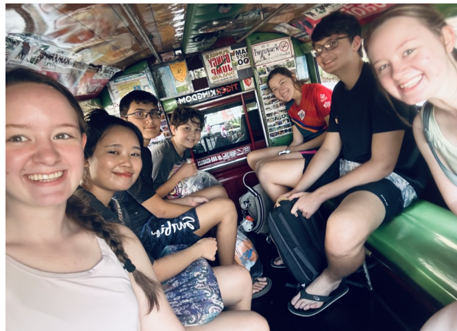
Highlight #3: Making long-lasting relationships with the people of Thailand.