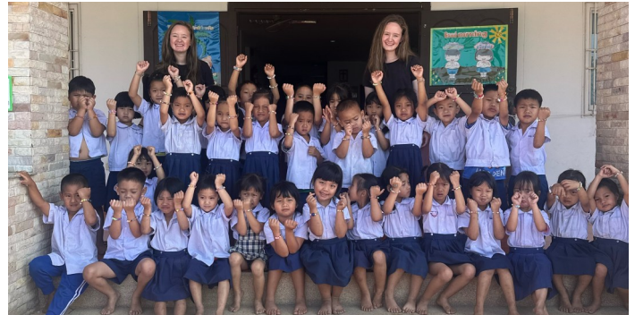
Highlight #2: Spending time at the House of Blessings, which is a preschool for tribal kids.