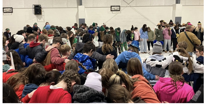
Students huddle up in prayer during a worship time at Snow Camp.

“In previous years, during that first session on Friday night, it took a lot of work to break the ice between youth groups. This year, from the time the guitarist hit that first chord, you couldn’t find space between one youth group and the next. They were shoulder to shoulder, all there together to worship Jesus.”