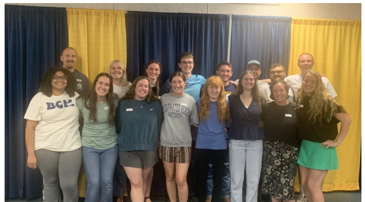
BCM graduates from West Virginia University

"Changing Lives that Change the World" is more than a slogan—it is the mission of Baptist Campus Ministry (BCM) . Each May, that mission becomes reality as we celebrate graduation and send our students into the world.