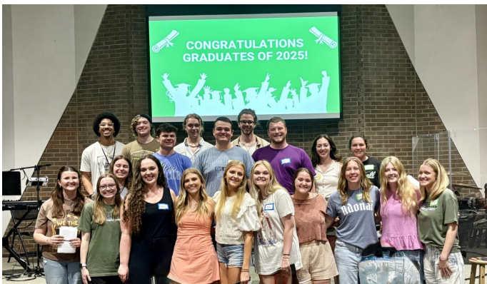
BCM graduates from Marshall University

So Christ Himself gave the apostles, the prophets, the evangelists, the pastors and teachers, to equip His people for works of service, so that the body of Christ may be built up... - Ephesians 4:11