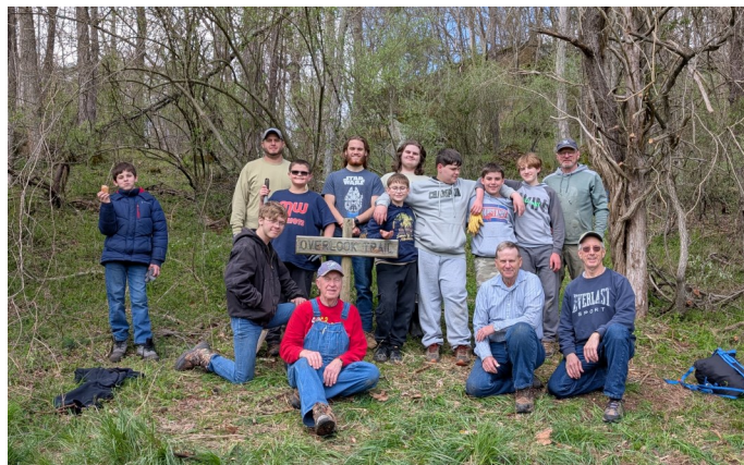
The ABMen with Troop 86 at Overlook Trail at Parchment Valley

At Camp Cowen, the pool was cleaned, a concrete pad was poured for the new Sunny Day Activity Center generator, outdoor bleachers were repaired, firewood was moved and numerous other projects were completed.