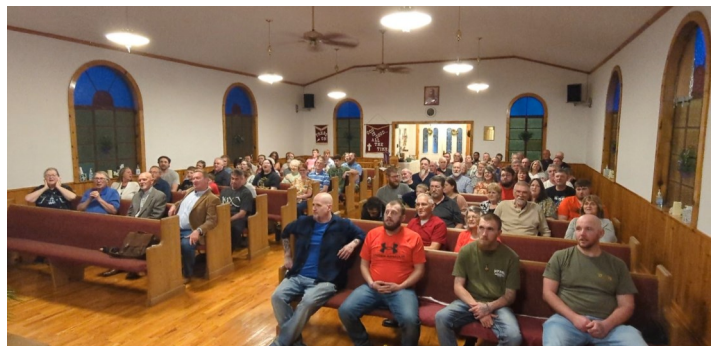
Hopewell Association Revival at Smoot Baptist Church.