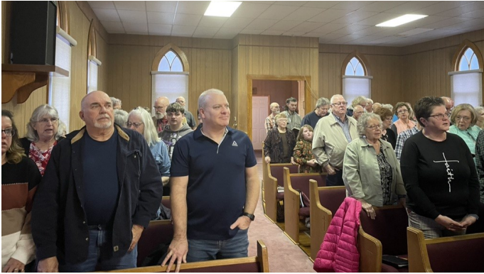
Night #3 of the Harrisville Association Revival at Cairo Baptist Church

As someone once said, "Where God guides, He provides." The world is not an accident. Neither is your church. Neither is your faith. Neither are you. In fact, having made known to us the mystery of His will, according to His good pleasure which He purposed in Himself , God planned the whole thing. Jesus of Nazareth, a Man attested by God...by miracles, wonders and signs was killed for us , but not by accident. He was delivered by the determined purpose and foreknowledge of God. It is by His stripes we are healed .