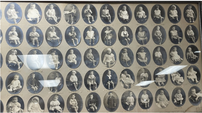
Cradle Role Call 1930s

Saint Albans First Baptist Church celebrated their 165th anniversary in a creative way. On Sunday, April 13, the congregation, along with visitors and special guests, gathered in the fellowship hall for a multigenerational birthday party, complete with games, singing, fun, fellowship and of course cake! Tables were decorated and organized by month with a wide variety of different cakes prepared by the ladies of the church at each table. Guests were instructed to sit at the table that matched their birthday month. Some took the opportunity to sample cakes from other tables (which was encouraged). Each person was asked to donate $1.65 toward their annual Easter offering.