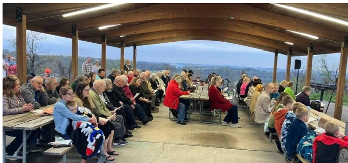
Easter Sunrise service with several Goshen Association churches.