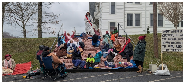
One of the stations at the Drive-Through Easter Celebration in Rainelle.

The entire season was such a poignant reminder that Christ is Risen! He is Risen, Indeed!