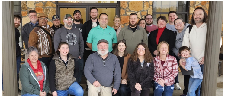
Students from both the New Testament I and Teaching the Faith courses combined for a group photo this past spring.

For more than 30 years, Palmer Seminary has been training pastors and leaders across our state through the WV extension at Parchment Valley Conference Center. This May, we celebrated the next group of graduates.