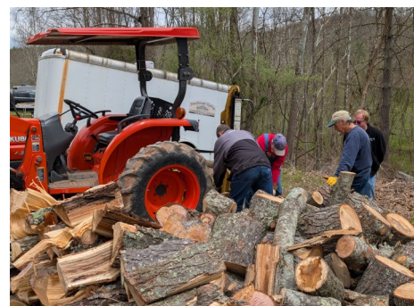
Chopping firewood at Parchment Valley