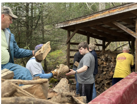
Stacking firewood at Camp Cowen