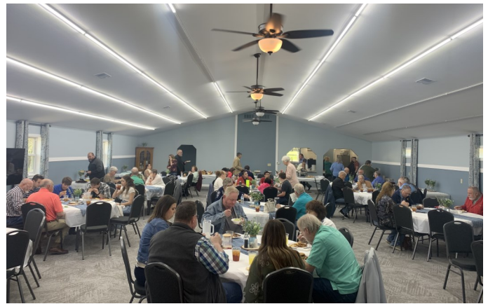
Celebration fellowship dinner at Middleville Baptist Church.