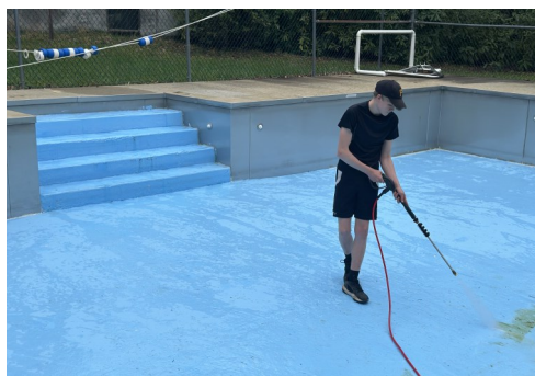
Cleaning the pool at Camp Cowen