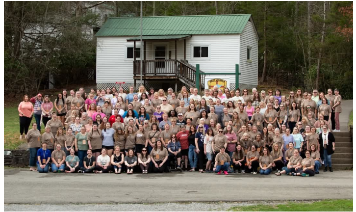
Over 175 women attended this year's Women's Camp.

Continuing the WVBC's theme for 2025, our evening activity included a prayer walk. Stations were set up around camp, including prayer prompts and scriptures to facilitate group and personal prayers. Please know your families, churches and communities were prayed over this weekend! Because of a suggestion on a registration form, we were able to add a bit of creativity to our evening activity. At each prayer station, the women picked up a ribbon, then we gathered in the dining hall and made beautiful Bible tassels and keychains. We hope these tassels and keychains remind us of all the beautiful parts of life we can bring to God in prayer.