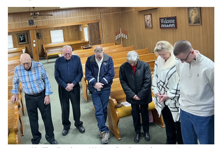
Mt. Zion Baptist and Hebron Baptist praying together.

The Place to Place and Heart to Heart Prayer Book in my region started in the Fairmont Association. Churches have been meeting together and praying for and with one another as the book moves from church to church. Recently, Mt. Zion Baptist prayed with Hebron Baptist as the people shared with their hearts with one another.