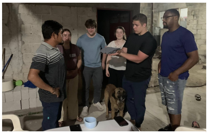
Last year's Fairmont State BCM mission team also served in Mexico.