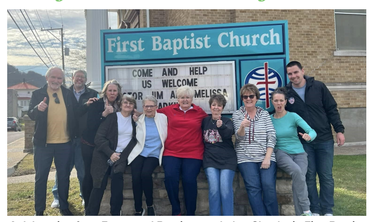
A delegation from Emmanuel Baptist traveled to Clendenin First Baptist to join them in prayer.

At last year's WVBC Annual Meeting, we kicked off a prayer initiative, inviting our churches to pray with one another and for one another. To help facilitate this initiative, four prayer books were designed that are currently traveling church to church around the state. In my area, the prayer book started in the Kanawha Valley Association.