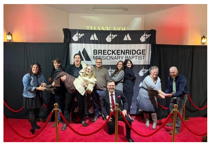
Breckenridge Missionary Baptist rolled out the red carpet to celebrate their volunteers.

For the past three years, we have gathered our volunteers to celebrate their hard work. But this year, we took it up a notch with a gala theme. We encouraged a semi-formal dress code (though it wasn't required) and pulled out all the stops—a red carpet, great food and even a 360 video booth. It was a night to remember and one that made a real impact on our team.