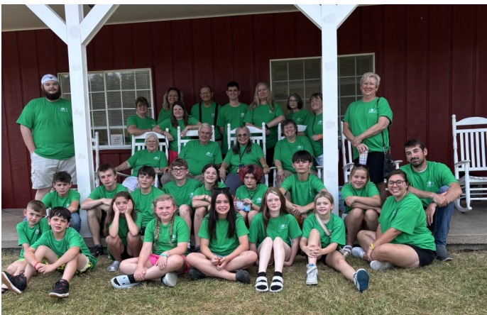
Some members of the Twelve Pole Association Camp