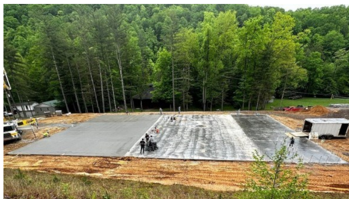
The concrete floor was poured in May prior to the camping season.

We are grateful for the ongoing support and excited to see how God uses the Sunny Day Activity Center for His glory! Not only will the activity center provide an alternative to having to stay in cabins during the frequent summer rains, but it will also provide a place for churches and the community to use during the off-season months.