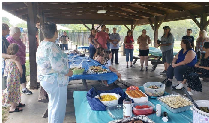
Picnic during Victory Baptist's 175th Anniversary celebration.