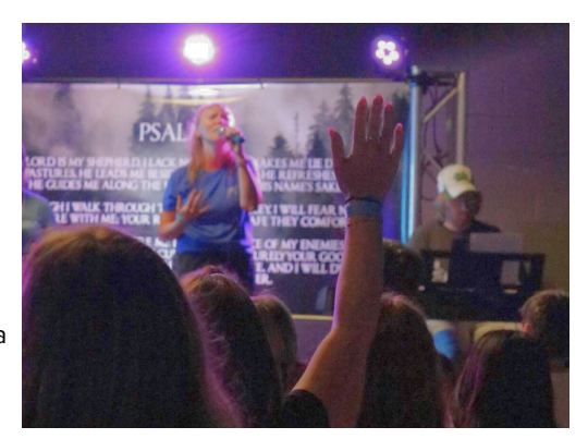
A worship service from High School 1 in 2023, which had 118 students.

With three-day camps for second through fifth graders, weeklong camps for middle and high schoolers, and camping opportunities for the whole family, there is a place for everyone at Camp Cowen. The generational ministry of camp allows us to grow in faith together , and to live out the kingdom calling as a unified Church.