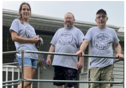
One BK team installed a handicap ramp for a homeowner's porch.

Over the years, more than a thousand homes have been repaired by BK participants. Last year added 40 new projects to that total, and saw 145 youth and volunteers from five different states.