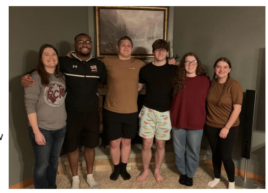
FSU BCM before departing to Mexico for their Spring Break Mission Trip.

In March, the BCM Board approved the launch of a new ministry at Davis & Elkins College. With this new addition, BCM now has a presence on nine campuses. Across these campuses, there are more than 60,000 students, making BCM one of our most important outreach tools for engaging people with the gospel.