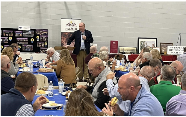
Palmer Theological Seminary Luncheon