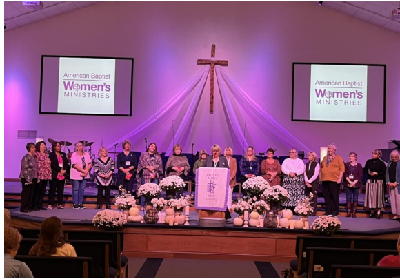
Next year's officers for the WV American Baptist Women