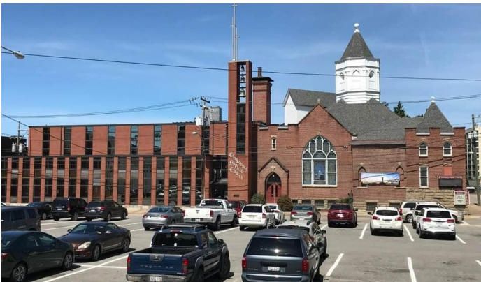
Clarksburg Baptist Church is part of the Union Association.