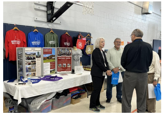
Enjoying the Parchment Valley display in the Exhibit Hall