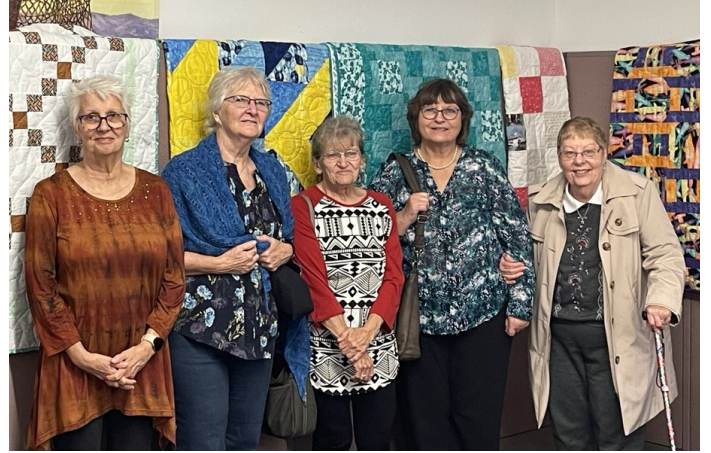
The Good Hope Association hosted a Quilt Dedication.