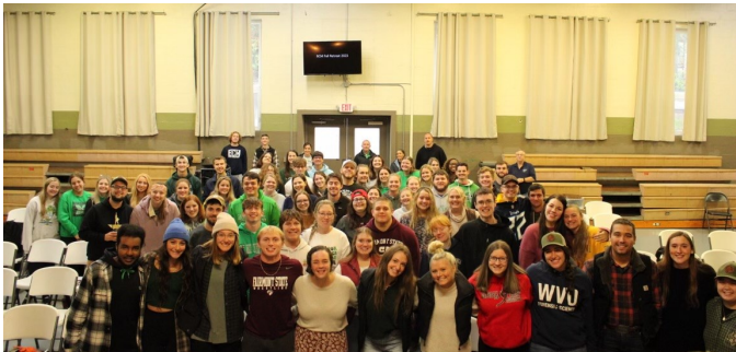
More than 80 students from four campuses gathered for Fall Retreat.

Listening to the students share and reflect the impact the BCM retreat had upon them is significant. Included are a few quotes from students who attended this year's retreat.