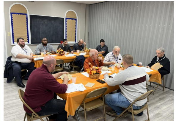
WV Baptist Education Society Luncheon