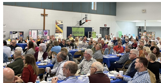
Baptist Campus Ministry Banquet