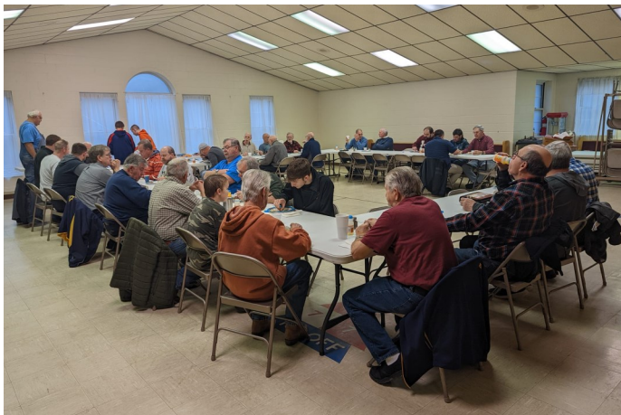
2023 Coal River Association National Men's Prayer Breakfast

The deadline to apply for next year's scholarship is February 28th. To learn more or apply, visit: https://www.wvbc.org/ministries/auxiliaries/american-baptist-men-wv/ .