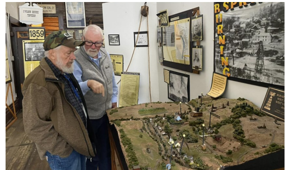
Some of the AB Men at the Oil & Gas Museum