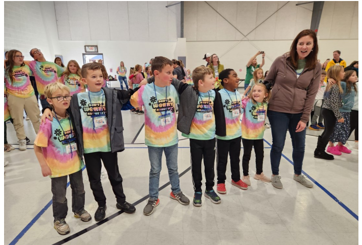
Kids enjoying a time of worship at the Fall Children's Rally.

In addition to the lessons, the kids were encouraged to bring donations for Life Choice, a ministry in Clarksburg that helps expecting mothers and their babies. Many items were collected,