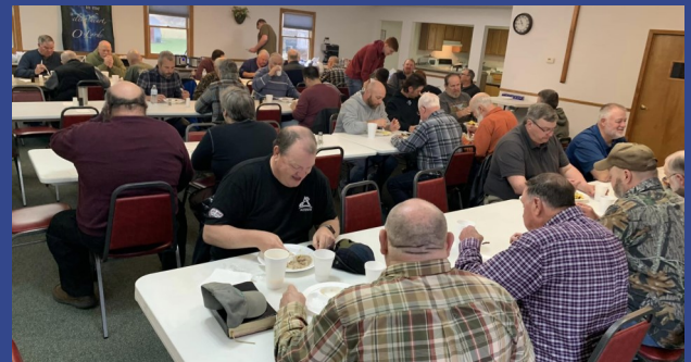
2023 Good Hope Association National Men's Prayer Breakfast

In-person locations throughout our state are now being sought for this important day in the American Baptist Men's ministry year: a time for our WVBC men to gather together for prayer and Bible study, while enjoying breakfast with friends.