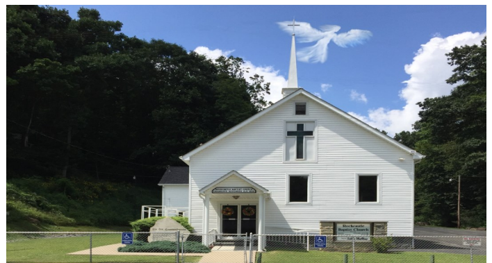
Rockcastle Baptist Church is located in Wyoming County, WV.

I was so encouraged to know that God's Word continues to be proclaimed through gathering and the sharing of God's love.