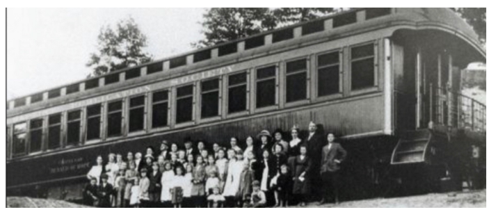
The "Herald of Hope" chapel car Sunday School class in 1915.

The "Herald of Hope" was the sixth of seven railroad chapel cars used by the American Baptist Publication Society, in the late 19th and early 20th centuries, to plant Sunday Schools and churches across the United States. A sanctuary and parsonage on rails, they could easily be sidetracked in small towns and people invited to hear the gospel.