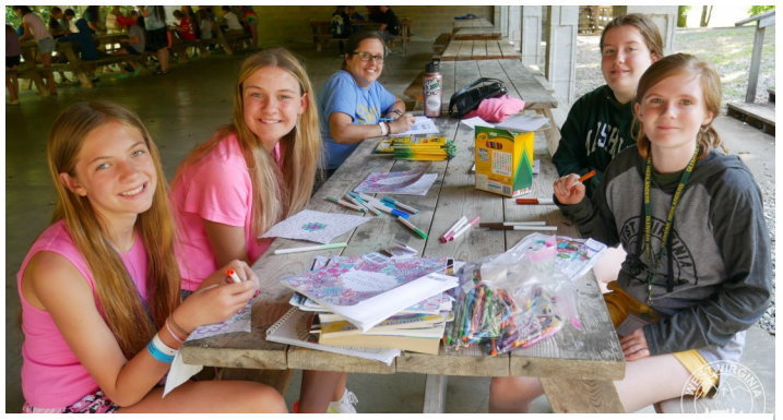
Coloring Group during Junior 1 Interest Groups.

Stories from each week continue to be shared, and we are thankful for God's provision, protection and blessing!