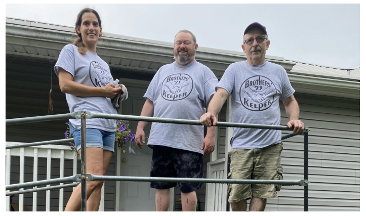
One of our BK teams installed a ramp on a homeowner's porch.

More than a thousand homes have been repaired as a result of BK over the years, and this year's camp added to that total. Representing five different states, 145 youth and volunteers completed a total of 40 projects around the area. These projects included handicap ramp installations, deck repairs, painting and more.