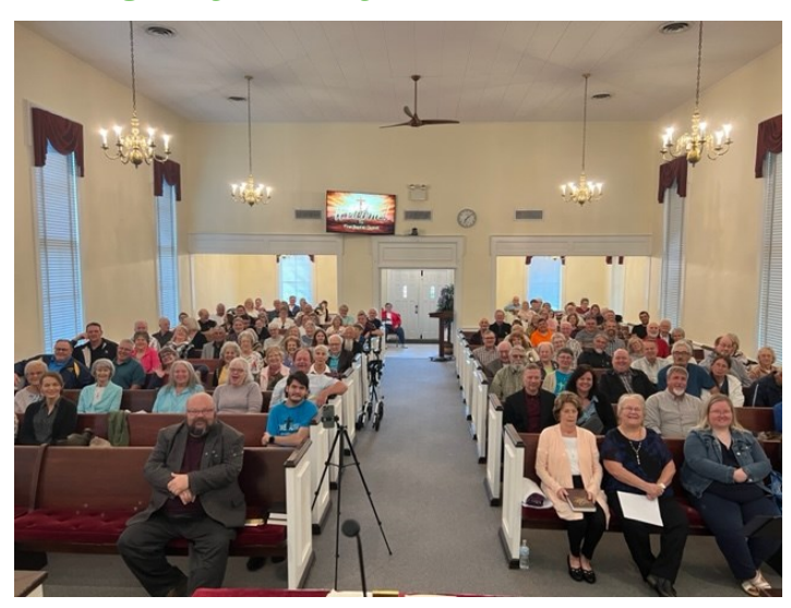
A full house at Ravenswood First Baptist Church during their Good Hope Association revival.