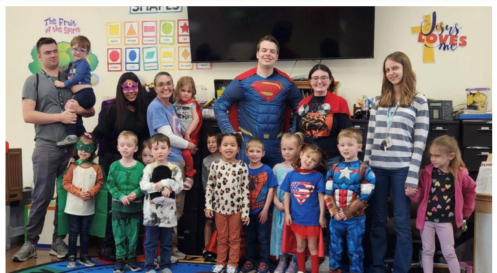
The Preschool Class recently celebrated Superhero Day, learning that Jesus is the ultimate superhero!

Our free preschool not only provides kids with a wonderful education, but it also gives us the opportunity to tell kids about Jesus! Additionally, we have an afterschool program that makes sure kids receive homework help, computers, dinner, transportation, Bible lessons, clothing, hygiene needs, etc. We also offer summer camps and scholarships for kids to attend a Christian school. Our Leadership Program encourages responsibility, financial literacy, work ethic and accountability. Our Community Garden teaches them how to garden and eat healthy. Through all of these programs, we have the opportunity to show them Jesus by mentoring them and teaching them to love, pray and be kind. Now in our 106th year of ministry, we have another new and exciting opportunity, as we are planning to become a Community