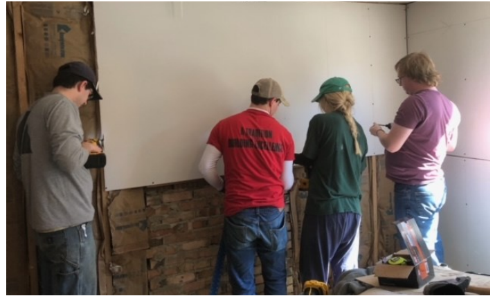
Four BCM students help hang drywall in a house in Jenkins, KY.

There were a variety of jobs our team completed – repairing a ramp, power washing, laying subfloor, painting, installing drywall and cleaning up debris. Overall there were five job sites (homes and community buildings) that we were able to help rebuild. During the evenings, we had the opportunity of listening to people share their flood stories. The impact of these stories, along with meeting different people, really helped us grasp the significance of our WVBC theme of “intentionally engaging communities for Christ.”