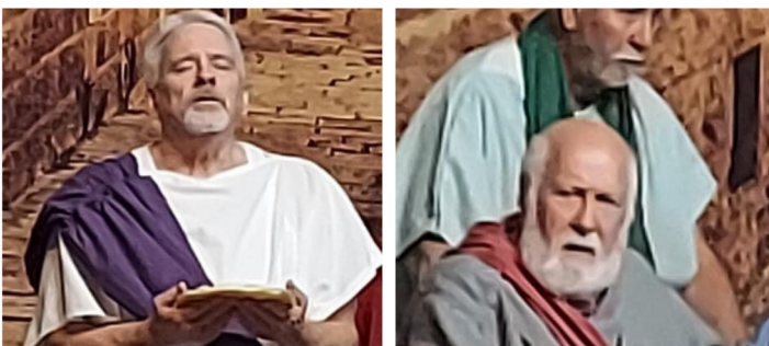
Scenes from the Last Supper portrayal at Middleville Baptist Church.