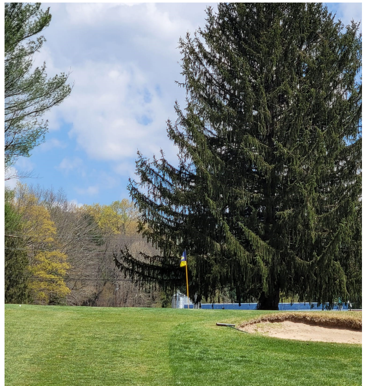
Nicholas Memorial Golf Course is located at: 19 Memorial Park Road, Summersville, WV 26651