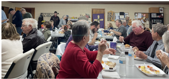
People “connecting” during a pre-service dinner at Auburn Baptist Church as part of the Harrisville Roving Revival.

As we look at the disciples, some of them found Jesus at work (James and John), some found him because of a family member (Andrew brought Peter, his brother) and some found him because of a friend (Andrew was influenced by John the Baptist, Philip brought Nathaniel). Kudos to those of you who will help this summer – planning events that will help people connect. But special honors to those of you who will bring someone to those events – and thus help them connect to Jesus. As Philip said to Nathaniel, “We have found Him...” Let us remember to share him.