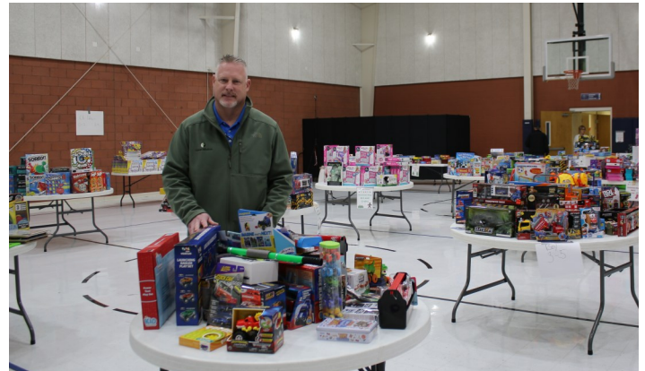
Each year the Union Mission organizes a Christmas Toy Shop which allows hundreds of families to hear the gospel and then choose toys for their children and teens.

The Union Mission is proudly a Christian organization. We “help hurting people in Jesus’ name” regardless of their religious beliefs,