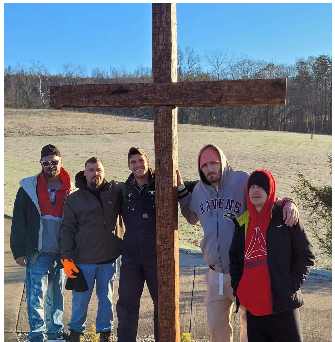
Several Hope Center Ministries guys help erect a cross at Gilboa Baptist Church.

To learn more about Hope Center Ministries, email me at b.mcclure@hopecm.com or visit our website at www.hopecm.com .