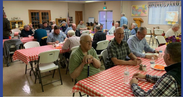
2019 Judson Association National Men's Prayer Breakfast

In person locations throughout our state are now being sought for this important day in the American Baptist Men's ministry year; a time for our WVBC men to gather together for prayer and Bible study, while enjoying breakfast with friends.