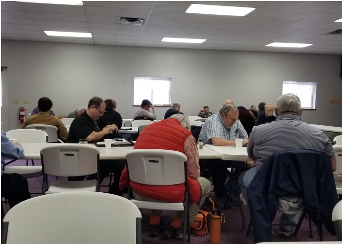
2021 Union Association National Men's Prayer Breakfast

The American Baptist Men (ABMen) of WV are excited to announce the start of their annual scholarship program, designed for young men of WVBC churches who will be attending college or technical schools after high school graduation. The scholarships will be awarded annually with the amounts determined by the ABMen Scholarship Review Board, based on available funds. Applicants can apply annually between January 1st and February 28th. The scholarship will be for the upcoming fall semester and selectees need to re-apply annually. To learn more, visit: https://www.wvbc.org/ministries/auxiliaries/american-baptist-men-wv/ .