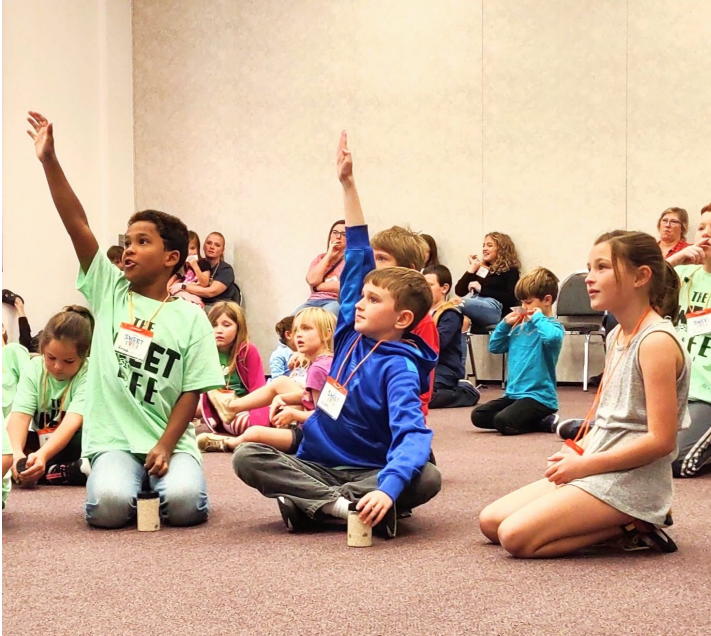
Children at the Fall Children's Rally learning about "The Sweet Life."

Children's Rallies are for elementary-aged students and always take place at Parchment Valley in both the fall and spring. The Spring Children's Rally will be held March 4th, 2023. We hope you will join us.