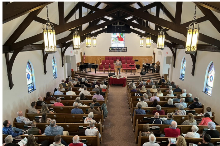
This year’s meeting was hosted by Summersville Baptist Church.