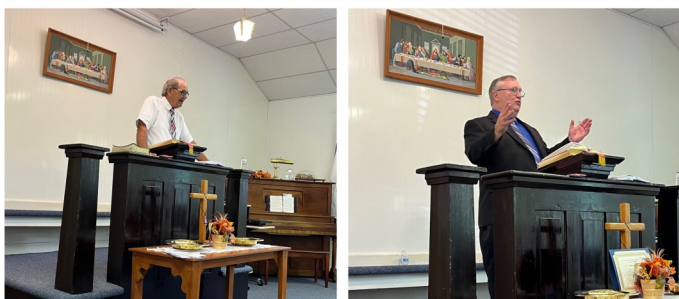
Scenes from Bethel's 150th Anniversary celebration.