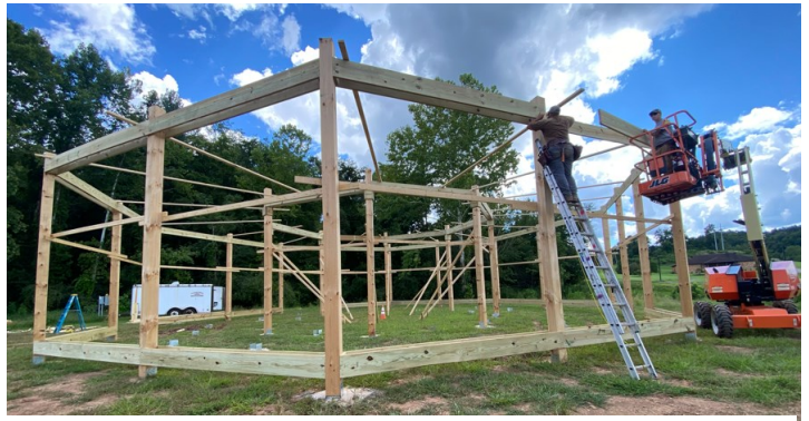
Volunteers began assembling the exterior of the covered campfire in August of this past summer.