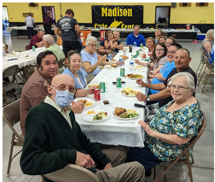
A group enjoying a meal together at the Coal River Association’s Annual Picnic.