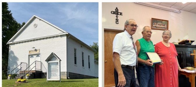
More scenes from Bethel's 150th Anniversary celebration.