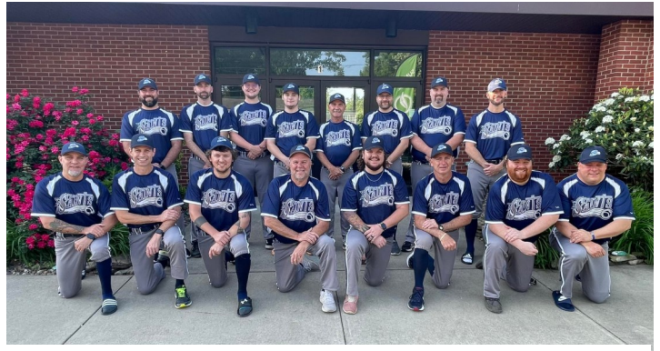
The WV Saints pose for a picture prior to one of their trips.

As of this writing, the WV Saints have traveled to three prisons so far this season, with five more on our schedule for August 6 and