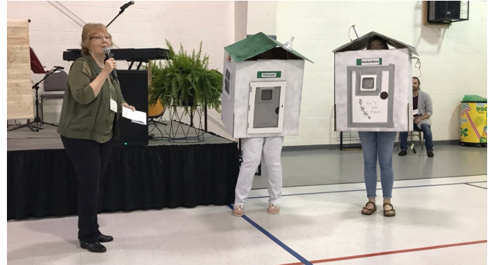
During the conference, an update was given on their 2022 Special Project: Camp Cowen’s Adopt-a-Cabin program.

Just as the early disciples moved “along the road,” spreading the Good News, may the ABWM continue to do the same, just as they have done for the last 88 years.