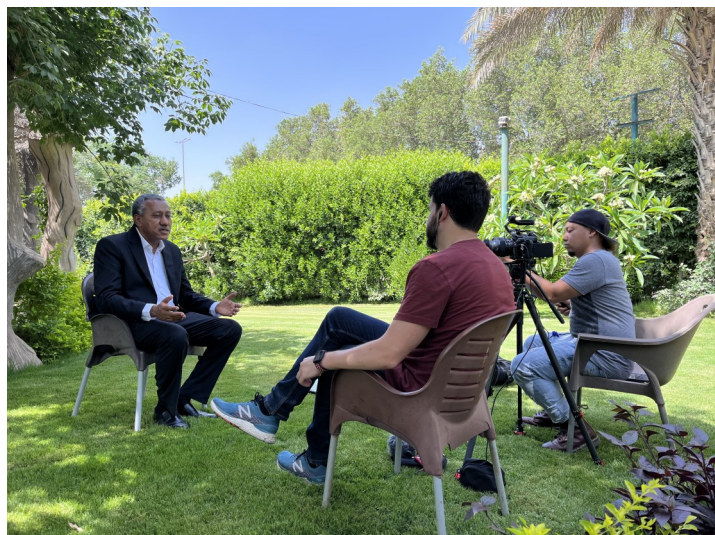
Interviews were conducted with each of our Enduring Love missionaries and will soon be available at www.enduring-love.org .

It was incredible to see first-hand how God is at work across the MENA region. There is a great spiritual awakening and people are coming to Christ at record numbers. I am grateful that God is allowing Enduring Love to be part of it!