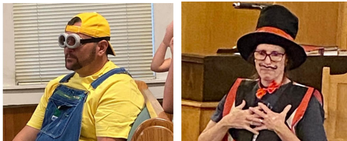
VBS volunteers from (left to right) Victory Baptist Church (Broad Run) and Nutter Fort First Baptist Church (Judson).

VBS has become so much more creative and interactive than when I was a kid back in the Dark Ages. At our VBS, we would march into the sanctuary in some grand processional, say the pledges to the flags and Bible, sing a couple of songs, recite a few Bible verses and then march off to our classes. I don't ever remember one of our pastors dressing up like a circus ringmaster and such.