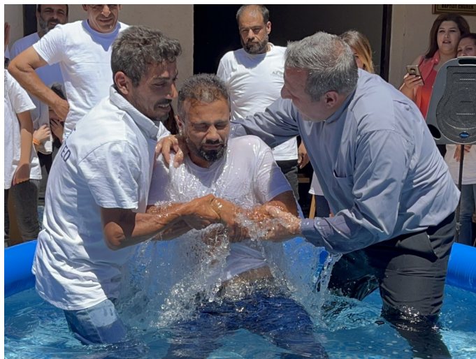
Six new believers were baptized in Ain Zhalta, Lebanon.