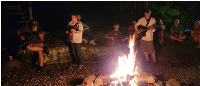
Several dozen musicians gathered in worship around the campfire at Camp Cowen's first-ever Musicians Summit.