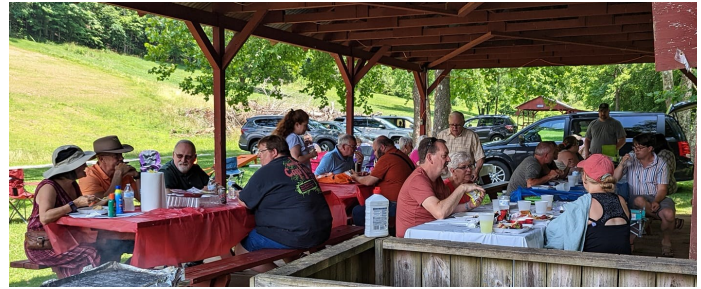
Several pastors and their families enjoy the second annual Summer Family Picnic at Parchment Valley Conference Center.