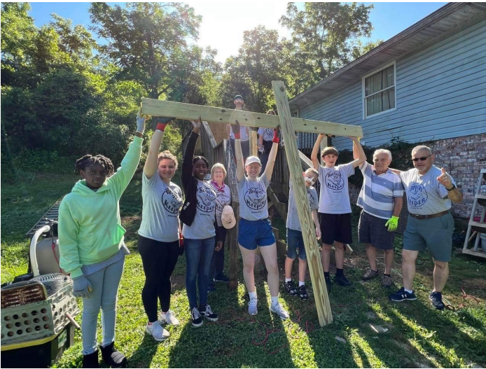
A team of youth providing hope to the homeowner by rebuilding his deck.

Brothers' Keeper (BK) 2022 celebrated another year of watching the Holy Spirit change lives throughout Jackson County. This missional work camp was comprised of 131 people from 18 churches representing eight different states. It was exciting to see how both our adults and young people came together to serve both the community and the Lord.