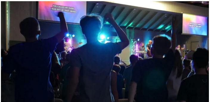
Students at Junior High 2 Camp are enjoying a time of worship.

From being ready to give up on God to being a child of the one true King in a span of six days is something maybe no one but God saw coming. What a blessing it is to know Christ and to make Him known among all people!