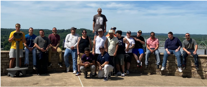
A group from Hope Center Ministries at the downtown Parkersburg overlook, located at Fort Boreman.