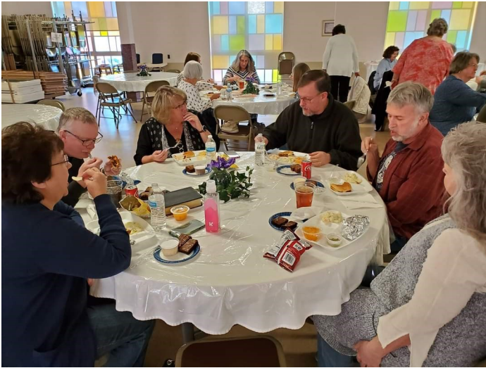
The Baptist Temple, Fairmont, was one of three host sites for the Biblical Intentional Grandparenting Seminars.