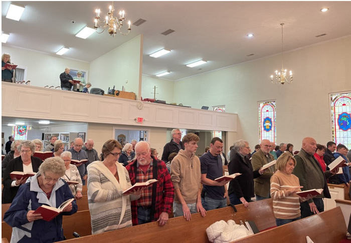
The opening night of the Harrisville Association revival was hosted by Harrisville Baptist Church.

The story of Jonah is a fascinating one. It is about crime and punishment. It is about disobedience and grace. But it is also about God's provision. God provides. For the Ninevites, He provides a preacher and a chance to repent. For Jonah, He provides a great many things – most famously, He provides the fish. That is the word it uses, depending on your translation. God “provides” or “appoints” a fish to swallow Jonah, both to rescue him from the depths of the sea and to imprison him while he contemplates some repentance of his own. Later, God provides a plant to shade Jonah, followed by a worm to destroy the plant and a scorching east wind. All of these things were provided in order to further Jonah's spiritual journey.