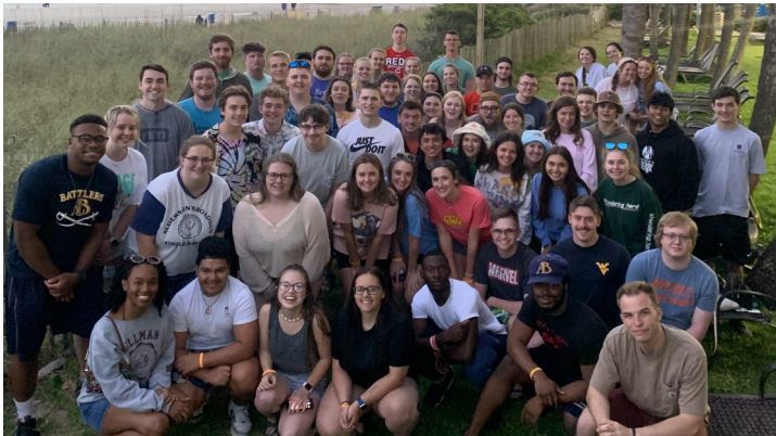
73 students participated in Beach Week 2022.

Post-pandemic, building community is vital to our goal of reaching college students with the love of Jesus. Many of our Baptist Campus Ministry (BCM) associates were forced to find new ways to develop community over the last couple of years, but it has been to once again be physically active on our campuses and in our communities this past year. The following quotes provide just a glimpse of what that looked like this past semester: