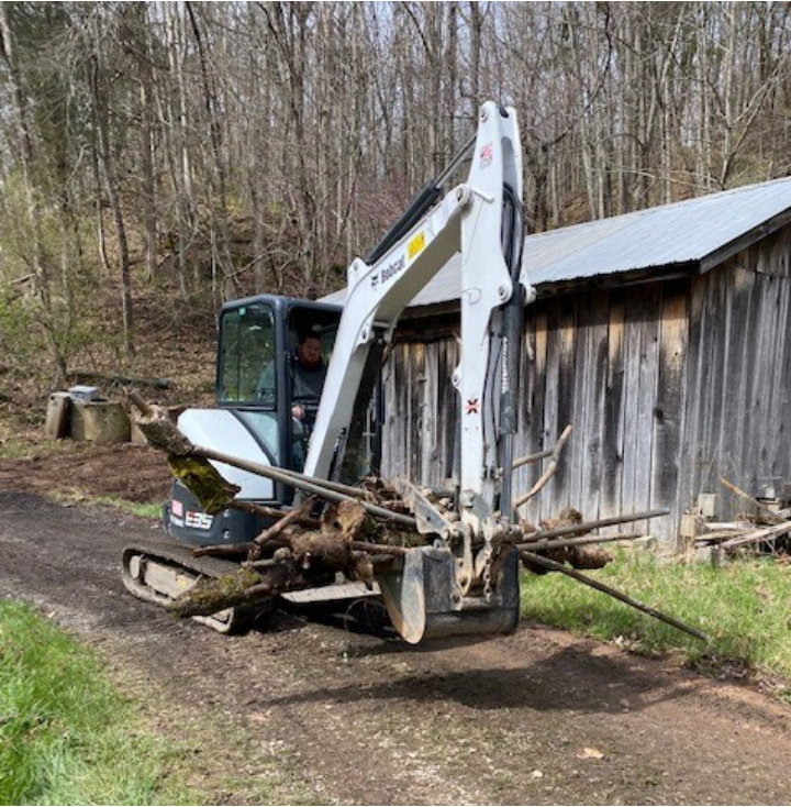
Volunteers moved branches and other debris during the work party.

I was always told, “When the going gets tough, the tough gets going.” The work party at Parchment Valley Conference Center was an example of that. It was an absolute success as our loyal volunteers came together to prepare the facility for an upcoming season of worship, fellowship and reaching people for Jesus.