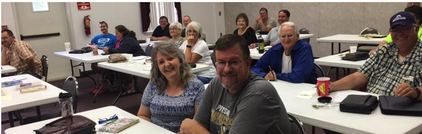
The Bobby Wood School of Christian Studies has been equipping people for ministry since its formation in 1993.

What if I were to tell you that there is a flexible and affordable way to learn more about the Bible, Theology, Church History, Community Ministry, Discipleship, Evangelism, Teaching and many other topics!? While the Bobby Wood School of Christian Studies (BWSCS) has its roots in providing valuable education for pastors of local churches, it is also available to church leaders, Sunday School teachers and anyone who enjoys exploring biblical and ministry-related topics. It is a great opportunity to become better equipped to serve wherever the Lord calls you. Numerous bi-vocational pastors who were trying to juggle family, work and ministry have found the flexibility of the program an ideal way to fit continued theological study into their already full schedules.