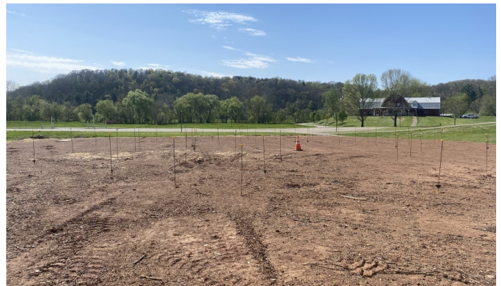
The soon-to-be site of the Whippoorwill Covered Campfire.

It is amazing watching God work! And it is also amazing see God’s people step up and serve! The response across the state has been overwhelming as churches and individuals have continued to make donations to help fund this new facility.