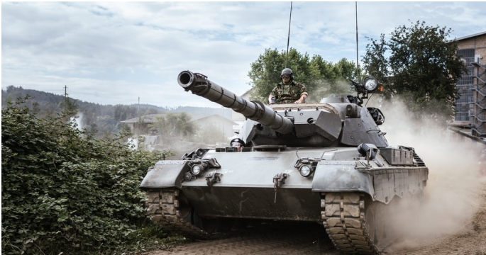
The war has had a major impact on the WVBC Russia Mission Partnership.