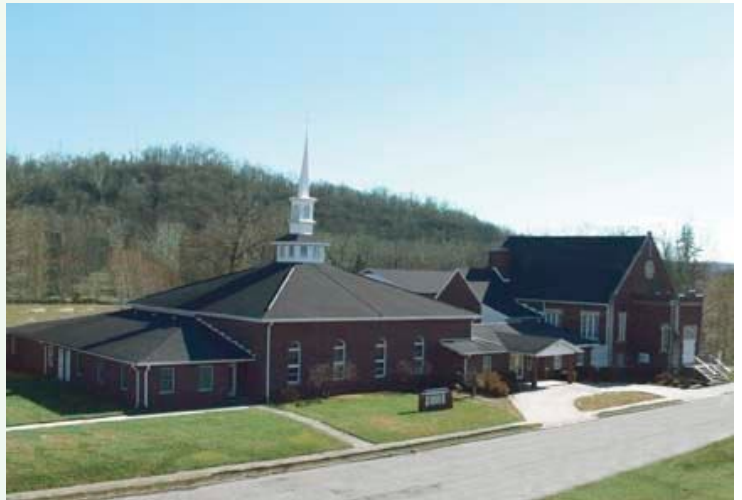
Main Street Baptist Church is located in Point Pleasant, WV.

Upon Mildred's death in 1993, a trust was established with the West Virginia Baptist Convention (WVBC) for the benefit of Main Street Baptist Church. Through investments, that trust has grown to over $230,000 and continues to support the church's needs. Per the documentation, the trust is administered by the trustees of the WVBC and remitted to the church upon their request. The most recent distribution assisted the church during the COVID-19 pandemic.