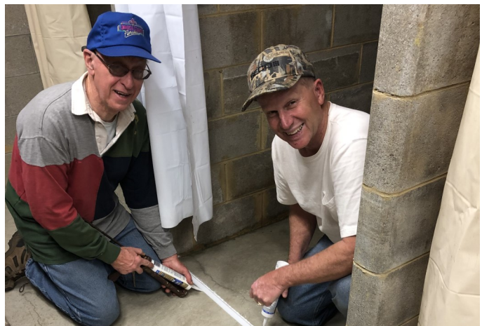
Repairs being made to the camper bathhouse.

Since 1943, the West Virginia Baptist Camp at Cowen has been blessed with hard-working volunteers who donate their time, talent and finances to build camp into the wonderful facility we have today. Work days provide the opportunity for groups to come together and work to maintain the camp property. Camp would not be the same without all of your help! Thank you to our many volunteers and camp supporters!