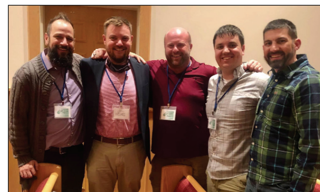
The Annual Meeting presents a great opportunity for fellowship