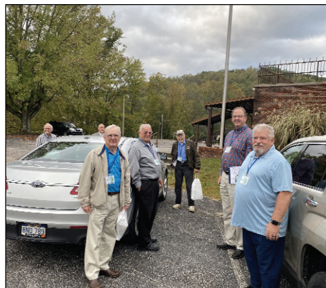
The American Baptist Men at Men's Day