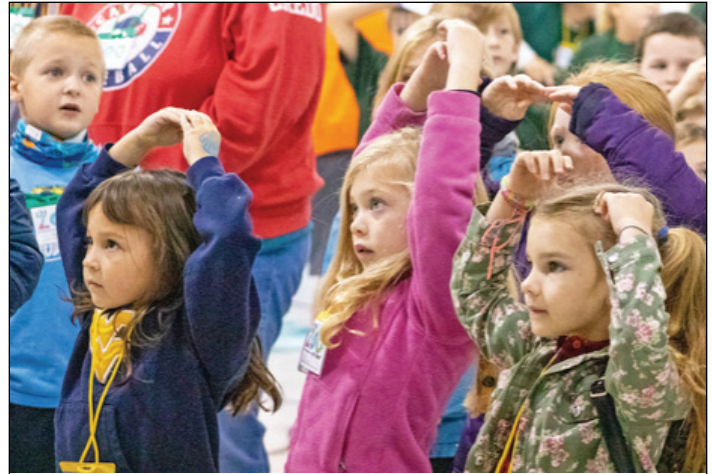
Children enjoy a time of games and interactive worship in the Greenlee Activity Center at Parchment Valley Conference Center.

When asked about their favorite part of the day, several children said they enjoyed the crafts - especially making the parrot. Others said they enjoyed the games, others enjoyed learning