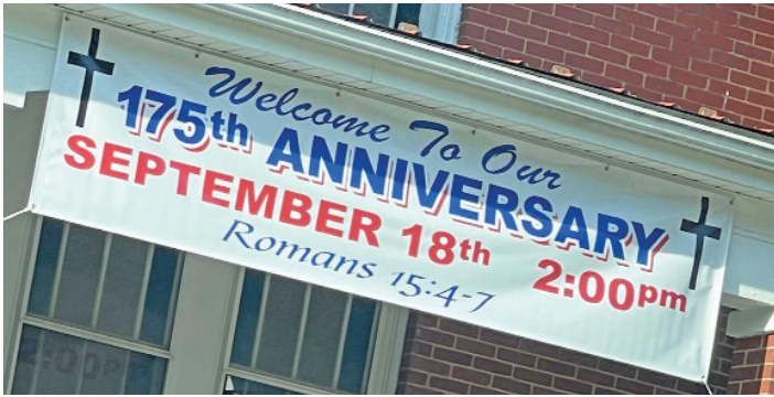
Auburn Baptist Church celebrated their 175th Anniversary this year.

Many years - perhaps even most years - we have some churches celebrating significant anniversaries. The purpose of these celebrations is not just to reflect on being old, but to think back over the years of service and rejoice in all the ministry that