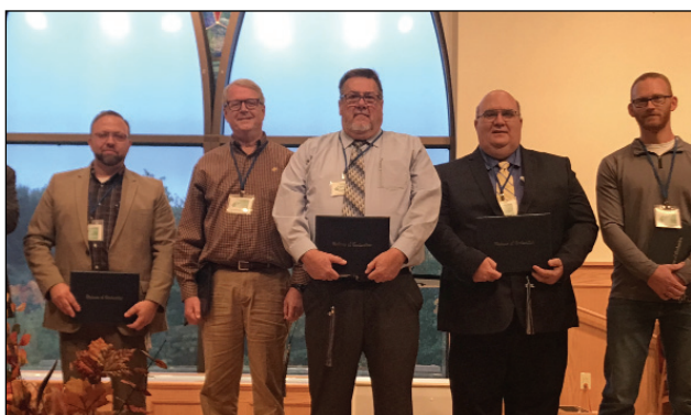
The 2021 Bobby Wood School of Christian Studies graduates