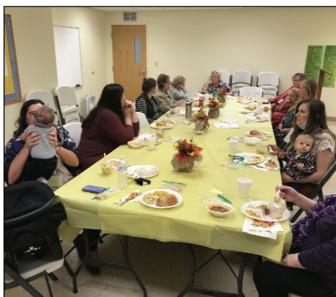
The Minister's Wives Fellowship luncheon