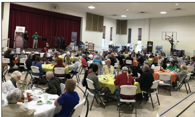
The gymnasium was full for the Baptist Campus Ministry banquet