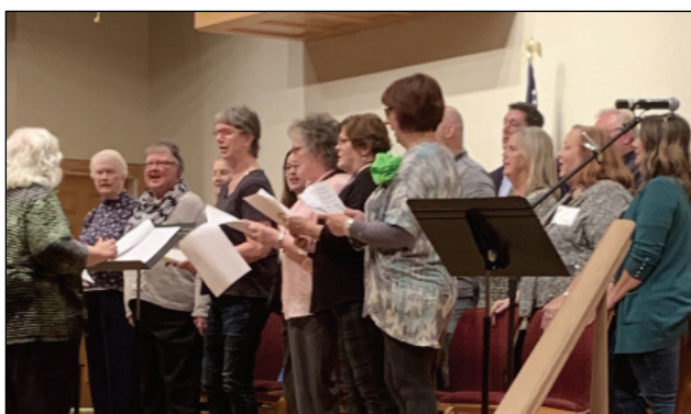
The Mount Vernon Baptist Church choir