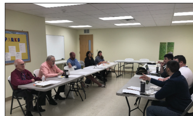
The WV Baptist Education Society meeting during breakfast