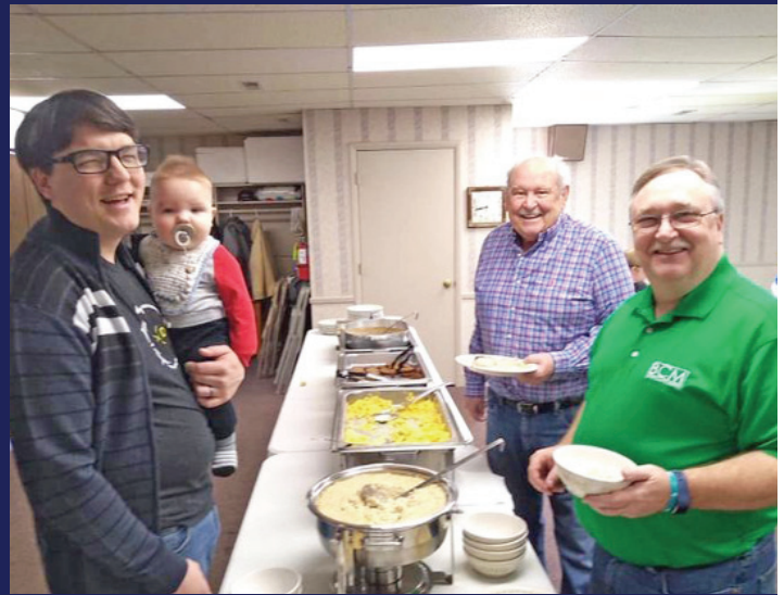
2019 National Men's Prayer Breakfast at Crab Orchard Baptist Church

If your church is interested in hosting a prayer breakfast on that date, please let us know. The reported sites will be posted on our website and publicized via e-mail. We can also help provide you with speakers and materials to help you coordinate your breakfast.