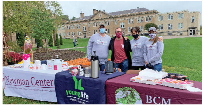
Fairmont State BCM participating in a campus-wide outreach event.

At the University of Charleston, they were once again able to host their annual Thanksgiving Dinner and serve several dozen international students. They missed doing this last year.