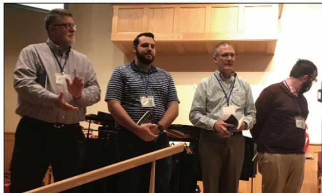
More than a dozen new pastors were recognized