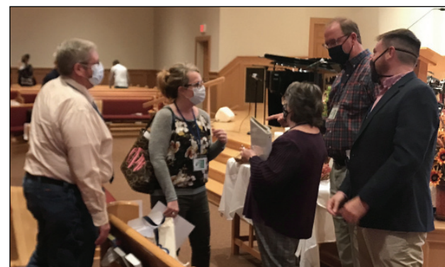
Several of our WVBC officers talking during a break