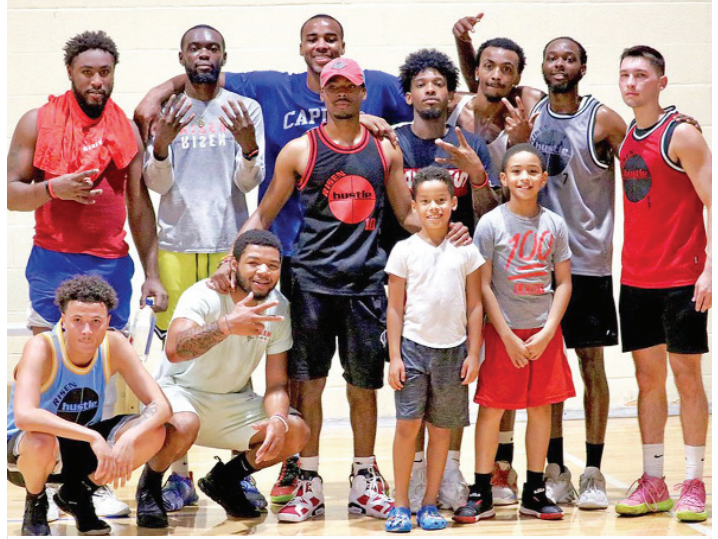
A group of students playing basketball at the North Charleston Community Center.

Microchurches are one of the many ways that we are intentionally engaging communities for Christ.