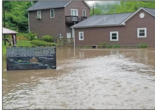
The recent rising flood waters in Fayette County