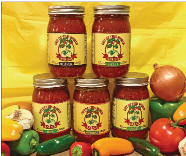
Out of This World Salsa

Out of This World Salsa is a mission project under the non-profit La Casa De La Amistad that provides assistance to