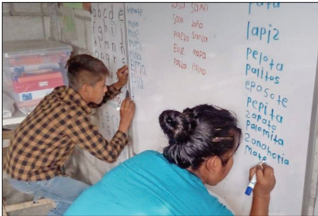
Literacy program in Carmen Grande

We are on our third year of service in Chiapas! The current COVID-19 crisis, however, has forced us to cancel all of our