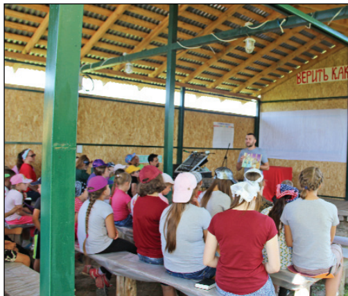
Camp Alpha, located in Ryazan, Russia

were 65 children that attended Camp Alpha. The camp currently has two shelters, two storage containers repurposed into cabins, outhouses, fields and an open campfire where some meals are prepared. Other meals are brought in from local churches. The camp currently uses tents to house the other children.