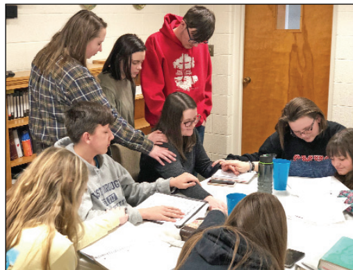
The current YLC group joins together in prayer.

worked with 17 students from 11 different WVBC churches. Three of the most powerful aspects of this program are: 1 - connection, 2 - homework and 3 - community. This isn't a leadership program that happens in isolation, students are nominated from their local church, and connection to a local church is an essential component to putting leadership skills into practice. Students select an advocate, an adult from their home community to walk