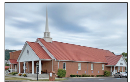
Romney First Baptist Church