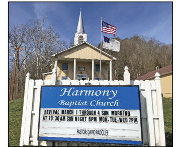
Harmony Baptist Church

The upper valley churches in the Kanawha Valley Association came together the week of March 22-27, 2020 in their annual roving revival. They met at different churches with a different pastor delivering the message each evening. It is always such a blessed time of worship when several churches come together to worship our Lord, to lead the lost to Jesus and to grow as His disciples together. To me, this is why we choose to be a family of churches, "Doing Christ's Work Together!"