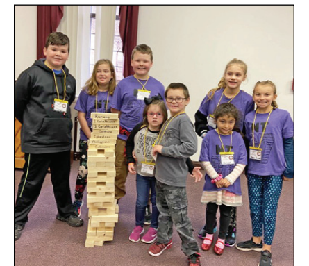
Spring Children's Rally attendees learn the books of the New Testament.

Reaching children with the gospel and teaching them about God's word is an essential aspect of our mission of Doing Christ's Work Together .