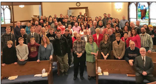
Members of Shinnston First Baptist Church meet in their renovated sanctuary.

After many months of work and many Sundays worshipping in the Lighthouse Activity Center across the street, Shinnston First Baptist Church (Judson) dedicated their newly