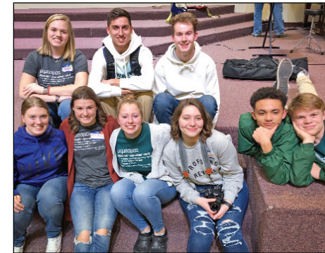
The Youth Ministry Planning Team (YMPT)

You know God is going to work powerfully when the weekend starts with the speaker issuing this challenge, "We were