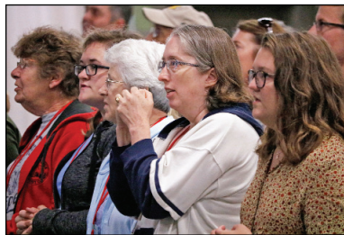
Attendees participate in a time of worship.