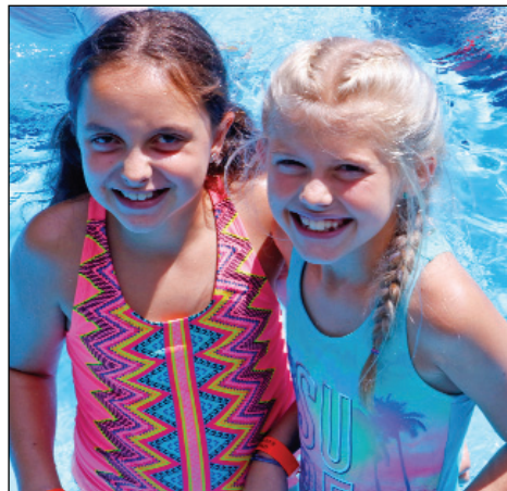
Lifelong memories and friends are made at Camp Cowen.