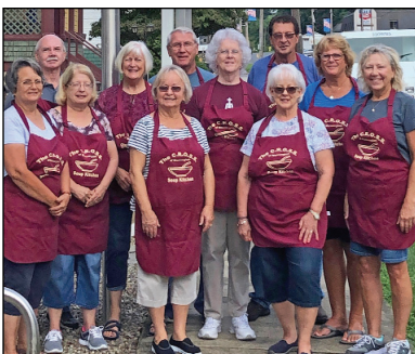
Fairmont Association members serve a meal at The C.R.O.S.S. Soup Kitchen in Mannington.