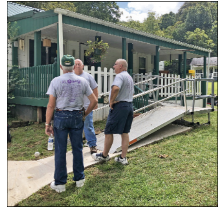
A wheelchair ramp is installed for a member of Leon Baptist Church.

a couple of requests for assistance with the building of wheelchair ramps for folks in our area. At the time of this writing, we have been able to install a ramp for a member at Leon Baptist Church (Teays Valley). I believe there is a need for this type of ministry across the state, so if we have some willing and able folks that would like to help in this area, please let me know so we can be a resource for our brothers and sisters in Christ across our West Virginia Baptist Convention family and beyond!