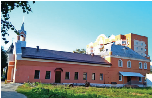
Central Baptist Church, Ryazan, Russia

Privet! Hello, fellow saints of the West Virginia Baptist Convention ! I'm excited to share some exciting news about our brothers and sisters in Ryazan, Russia. The first update is regarding Central Baptist Church, which is located in downtown Ryazan. The church, which was built in the 1800's, is considered