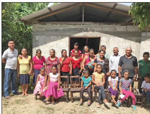
Members of a mission church in the Tselatl community of Petalcingo receive chairs for their children's ministry.

When we did our presentations about our call to serve in Chiapas, Proverbs 19:21 was our flagship verse. This passage keeps lighting our path. "We humans keep brainstorming options and plans, but God's purpose prevails" (The Message).