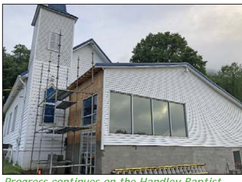
Progress continues on the Handley Baptist Church building project.

progress on their building project. They ran into some issues with termite damage in the existing structure as they worked to expand their space, but God has continued to bless them as things continue to come along. Pastor Cook