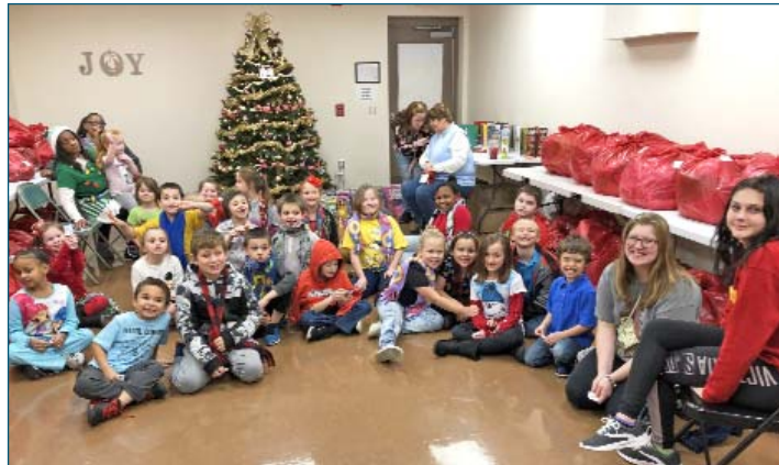
Weirton Christian Center kids and staff enjoying the Christmas season at the new center.

Connection into regular meetings with the help of our new social work intern. Please keep our mission, staff and board in your prayers as we strive to make a difference in the lives of children.