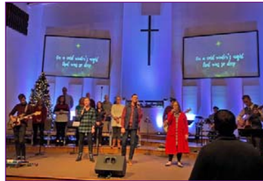
Pea Ridge Baptist Church (Guyandotte)

There is not enough space to mention all of the events that happened at Christmas. Many of our churches participated in the Samaritan's Purse Shoebox ministry. When I visited Fort Gay Baptist Church (Twelve Pole), they had a couple hundred boxes as other churches in the area added their boxes to Fort Gay Baptist Church for them to deliver.