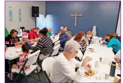
Attendees at the LifeSpring Community Fish Fry enjoy the first batch of fish from the aquaponics project.

munity Christmas fish-fry celebration. Lubeck Community Baptist Church (Parkersburg) assisted in the event by providing workers and side dishes for the attendees. Once again, those in need were targeted for this ministry and it was a big success. The fish was delicious, and it was a wonderful time of Christian fellowship and outreach. Christmas gift bags were given out to those who came. A special thanks to all those who have helped in this ministry, either by work, prayer or giving. God is certainly blessing it and the second and third generation of fish are growing!