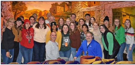
The college group posed for a picture at the Museum of the Bible in Washington, D.C.

To ring in 2019, 20 college students and six adults travelled to Washington, D.C. to experience the life-changing Passion Conference . Passion is a three-day event for college