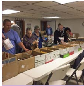
Danville First Baptist Church (Coal River)

We had many churches that assembled food baskets to lift up their neighbors during the holidays. Danville First Baptist Church (Coal River) put together and served 75 families with their generosity at Thanksgiving. Racine First Baptist Church (Coal River) reported they served 125 families for Thanksgiving. I know there were many more churches that participated in similar ministries.