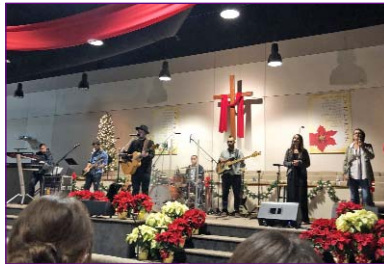
New Baptist Church (Guyandotte)