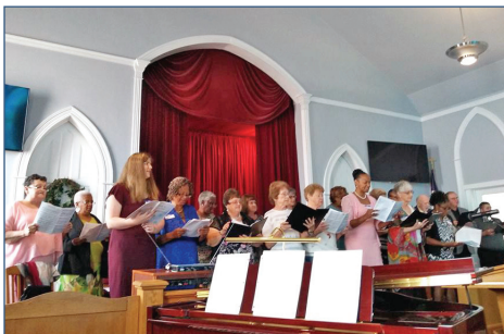
The combined choirs from Scott Street and Athens Baptist Churches perform at the Greenbrier-Raleigh Association Meeting.

During the annual Greenbrier-Raleigh Association meeting held at Athens Baptist Church (Greenbrier-Raleigh) on