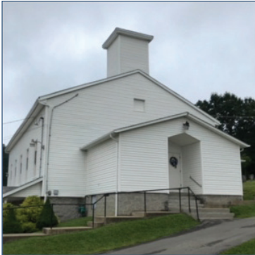
Beulah Baptist Church, Pruntytown