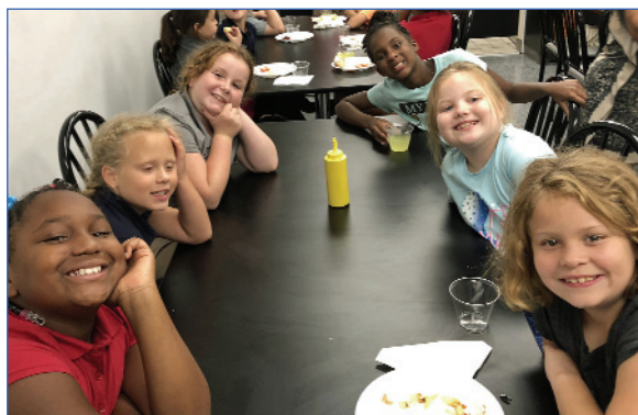
Dinnertime at the Kids' Cafe at the new Weirton Christian Center.

The mission of the West Virginia Baptist Convention is to empower local churches to be Christ honoring communities of faith and to help them fulfill their mission by enabling them to do together what they cannot do alone.