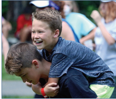
Camp fun: making new friends and buddy races. All in a day at camp.

power of God during times of worship. Children who learned of the great love the Father has for us as taught in the word. Teens choosing to share their deepest hurts with counselors and begin the path of healing as adults poured over them in prayer. Campers taking the brave steps to overcome challenges and grow skills. Leaders who stepped up to be used of God to share their testimony so that story could speak truth into the lives of hundreds of campers. Bible stories brought to the stage in skits/drama/dance, bringing the message of the gospel to life before our very eyes. Counselors who gave of their time to serve campers all hours of the day and night. Directors who prayed over their camps without ceasing. There are stories beyond measure of the amazing power of God at work in the community of faith at camp this summer.