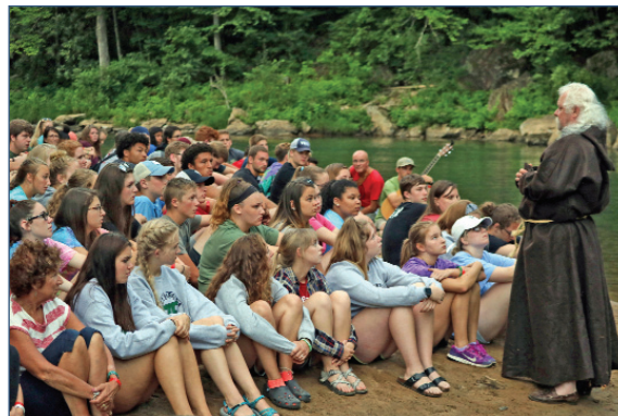
The New Testament comes to life during a consecration service beside the Gauley River.