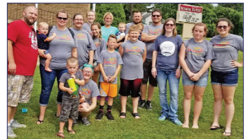
Pictured above is the Spark Youth Ministries' group from Sunrise Baptist Church.