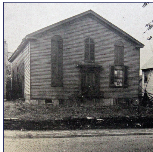
The old Ann Street church where the general association was formed.