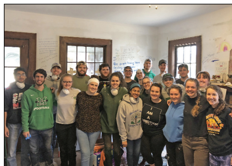
Baptist Campus Ministries' students working at ReBuild Ministries in Huntington.

The mission of the West Virginia Baptist Convention is to empower local churches to be Christ honoring communities of faith and to help them fulfill their mission by enabling them to do together what they cannot do alone.