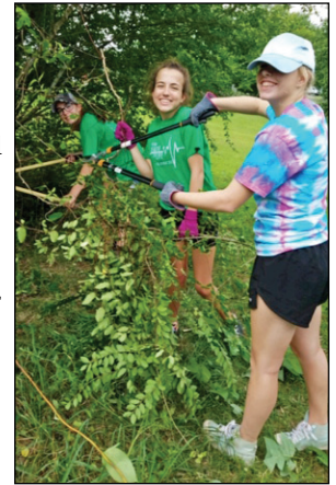
Youth from Williamstown First Baptist Church pitch in by trimming trees.