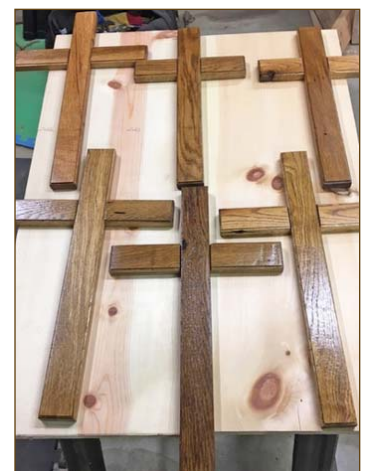
Crosses constructed of wood from the old dining hall floor.

Can you commit to making a regular monthly donation? How can God use you to multiply efforts through a unique fundraiser to bless this project? I don't know all the details, but I know God has people in place now that will set the foundations and build future projects at the West Virginia Baptist Camp at Cowen . Is God calling you to jump in and be one of those people today?