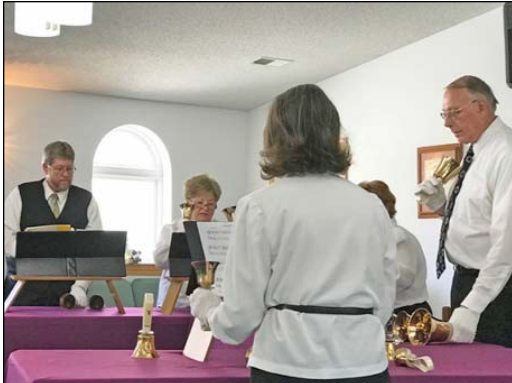
Pictured above is the New Martinsville First Baptist Church Handbell Choir.

was at Pine Grove First Baptist Church (Panhandle). Music included lots of styles: Christian contemporary, Southern gospel, blue-grass, acapella and traditional hymns. Everyone was encouraged to sing.