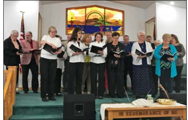
New Martinsville First Baptist Church and Sistersville First Baptist Church join together for a joint choir.

Traditional hymns were sung by the gathered congregations as the groups transitioned.