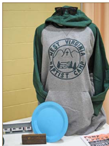
Camp Cowen memorabilia from 2000-present.

We gathered on April 21, 2018 to celebrate the last 75 years as we look to the next 75 with hope and faith in the work God has planned. The vision we are pursuing in building the Sunny Day Leadership and Activity Center is to lay a solid foundation for the next 75 years of ministry as we seek to grow the ministry to our campers, the community and the Convention.