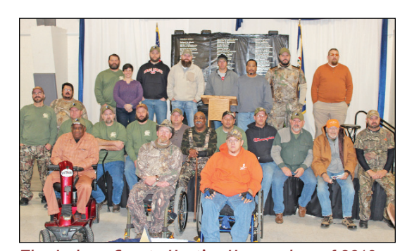
The Jackson County Hunting Heroes class of 2018.

incredibly humbled and blown away that you folks would take as much time and effort from your daily lives, not only to organize