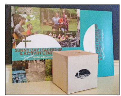
The Sunny Day block bank - fill one today!

Cowen campaign team introduced the Sunny Day block banks. These banks have been sent home with students and church leaders alike to help keep the fund-raising need of the camp at the front of everyone's mind. Because every donation amount makes a difference, the banks are