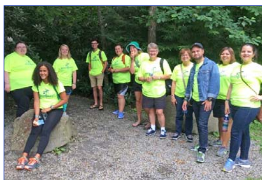
MissionQuest group hiking and team building at Endless Wall in Lansing.