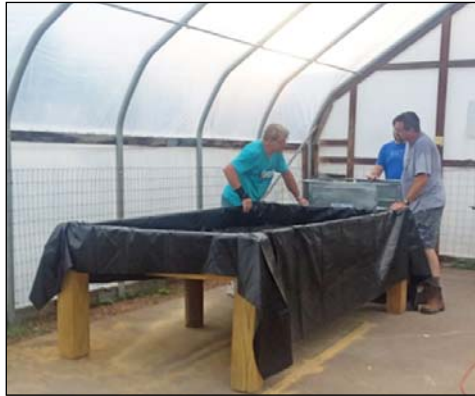
Setting up the fish tank and the grow bed for the plants.

When the idea of aquaponics was brought up in one of our leadership meetings, it seemed like the perfect fit. Aquaponics is a system of agriculture in which the waste produced by farmed fish circulates into a water table where it supplies nutrients for plants grown without soil. The plants, in turn, purify the water before it circulates back to the fish. The church