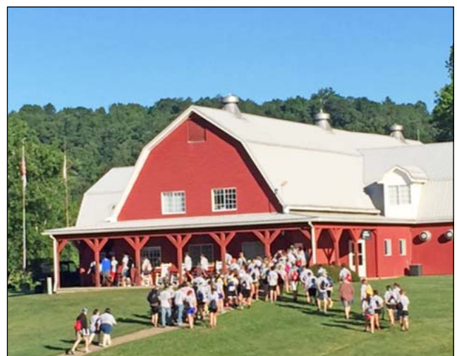
Brothers' Keeper participants gather at the barn at Parchment Valley Conference Center.

An additional note: in the previous week, at a church camp held at Parchment Valley Conference Center, several young people made first-time decisions for Jesus to be their Lord and Savior. That is the effect of the light of Christ shining through us for His glory!