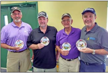
The winners of the 11th Annual Golf Scramble for the Bolivia House of Hope Missions: Crab Orchard Baptist Church (Greenbrier-Raleigh).

On June 10, 2017, eight golfing teams gathered together at Greenbrier Hills Golf Course in Rainelle for the 11th annual