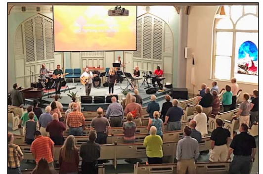
Opening worship was led by members of Clarksburg Baptist Church Worship Team and others.

Conference planners were pleased with the positive response to the new conference format and plan to offer a similar conference, annually, at different locations throughout the West Virginia Baptist Convention.