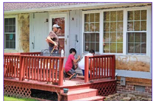
Youth from Crab Orchard Baptist Church working during week two.

We thank God that "Now you are the body of Christ, and each one of you is a part of it." Partnering with ABHMS, the churches and pastors of the West Virginia Baptist Convention, along with the prayers and support of people everywhere has made a world of difference in this town. All of us in Rainelle say a deep, heartfelt thank you for all the love and care God has shown through you.