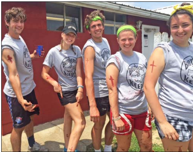
A Brothers' Keeper crew from Perrysburg, Ohio, on painting duty at the Jackson County Fairgrounds.

Send me your light and your faithful care, let them lead me; let them bring me to your holy mountain, to the place where you dwell. Psalm 43:3