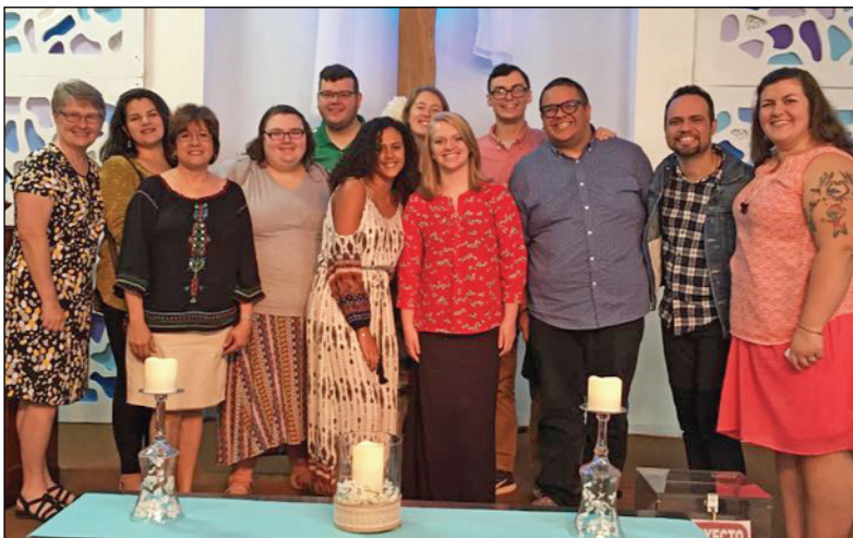
(Above and below) Members of the MissionQuest Project and staff members.