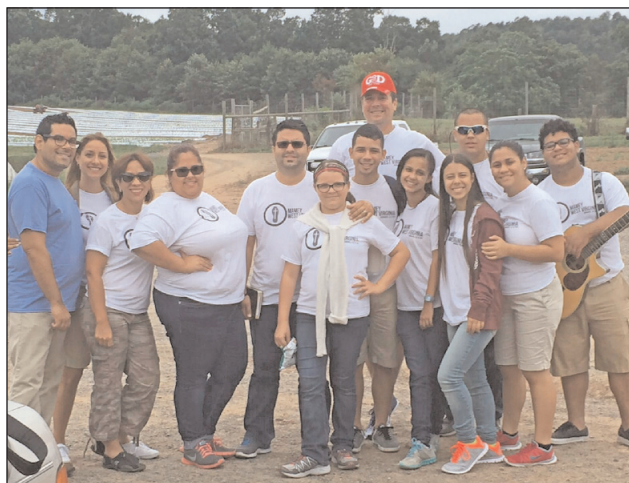
The mission team from Iglesia Bautista de Mamey