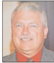
Pastor, Harrisville Baptist Church