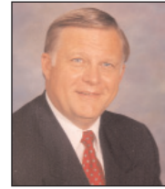
West Virginia Baptist Convention