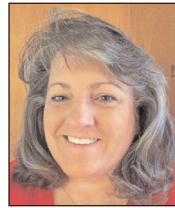
Minister of Music, Gassaway Baptist Church