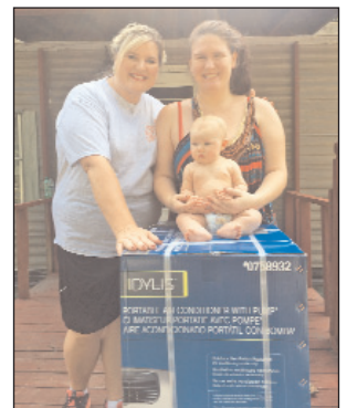
Residents of the Bleigh household with one of the portable air conditioners

Because of your gifts to the West Virginia Baptist Convention, Richwood First Baptist Church (Hopewell) has been able to distribute portable air conditioning units to two families in the Richwood area who were affected by the flooding that took place on June 23, 2016. Not only has God helped us to be a blessing, but one family has been attending our church services for the past four weeks after being ministered to after the flood. They are being touched by us being the outstretched arms of Jesus. We pray God will continue to let us minister alongside Him as we share the gospel with the people of the Richwood area.