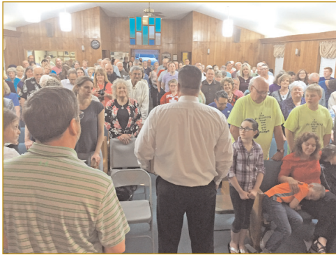
The churches of the Good Hope Association gather for a revolving revival.

The combined churches of the Good Hope Association celebrated a revolving revival from April 24 - 28, 2016. The first four nights were held at various churches within the association.