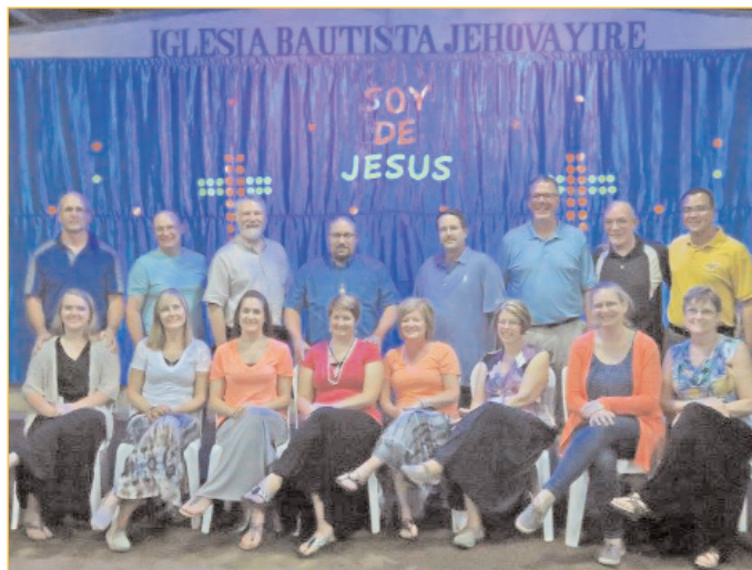
Lubeck Community Baptist Church Mission Team

While we only visit the sister church for nine days a year, the friendships and family that have been created sustain us all year long. We are brothers and sisters in Christ - borders mean nothing. Mantente bendecido - stay blessed.