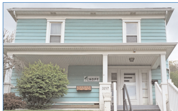
Evyenia's House of Hope

The first excavation has begun; the house we purchased next door is now gone!