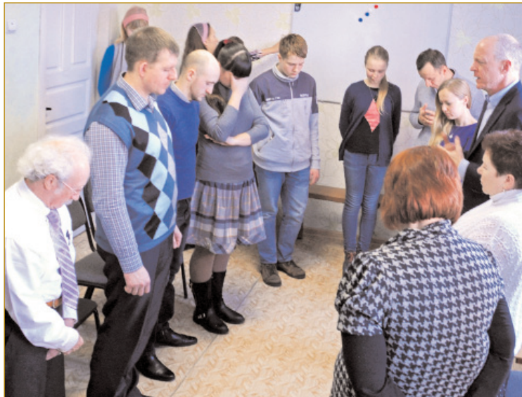
Praying with refugee Baptists from Ukraine.

God is opening doors for ministry relationships with the Russian people, and we saw it firsthand during both portions of this recent trip. If you would like to learn more about this trip or participation in the Russian Mission Partnership, you can contact me at 304.755.2224 or bessdr@wvusa.org . You can also visit www.wvbc-russia.org .