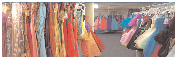
The House of Hope Dream Dress Place