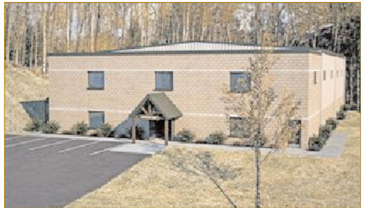
A rendering of the outside of the Sunny Day Leadership and Activity Center.

To get this new facility built and running by June 2017, we need $1 million by August 1, 2016. The time to give is now. Please pray about how God would have you help to make this new building possible for the 2017 camping season.