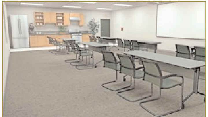
A rendering of the meeting room inside the Sunny Day Leadership and Activity Center.