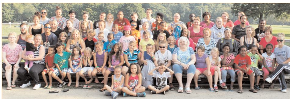
Fifty-four attended Weirton Christian Center’s week of camp at Elkhorn Valley, where 12 attendees gave their hearts to Jesus and were baptized, including one volunteer.

Another blessing came from a very generous man who grew up at his grandmother’s on Orchard Street, about three blocks from the center. A friend of our board president, he has been made aware of the work of the Weirton Christian Center and has decided to gift