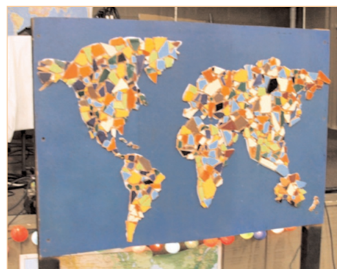
Map filled in with the broken pieces from the broken world lesson.