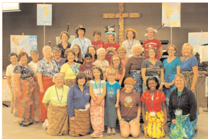
Women wearing their African cloth.

Camp Global is held each Labor Day weekend.