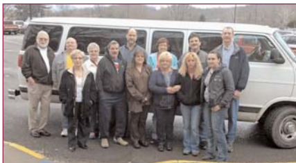
The Glen Falls Baptist Church basket delivery team.

On April 7, 2014, the members of Glen Falls Baptist