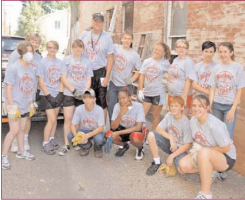
The Brothers' Keeper 2013 team.

This year, Brothers' Keeper , a mission work camp and non-profit ministry program of Parchment Valley Conference Center in conjunction with Community Resources, will perform its 14th year of service for the citizens of Jackson County. This event is a mission work opportunity sponsored for the youth of our churches across the state, and is now partnering with the youth from churches in Ohio. This camp impacts homes and lives of the less fortunate here in Jackson County, and blesses the lives of all who participate. In July 2013,