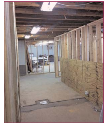
The walls are going up in the new bunk house area.

We thank God for you and the opportunity He gives to reach out with hands prepared for service and hearts filled with joy in serving Jesus Christ.