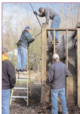
Men's Work Weekend participants work on taking down the rock wall.

The spirit of the Lord is truly upon this place as we see many difficult projects come to completion through the dedicated American Baptist Men of West Virginia, working together to prepare the way for more than 2,000 youth who will experience camp at Cowen this summer.