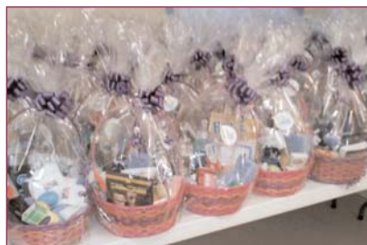
Baskets delivered to the veterans at the Clarksburg VA Medical Facility.

beautiful baskets to give to our veterans at the hospital. In addition to personal items, each veteran received a military Bible, a booklet about God and of course, candy! The veterans and staff were touched by everyone's generosity. It was a blessing for all involved to see how Christ can work in all our lives when we follow Him.