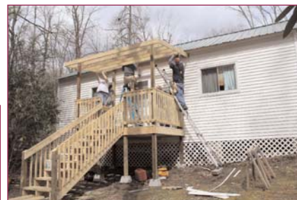
Men from Saint Albans First Baptist Church (Teays Valley) at work on Allen Cabin.