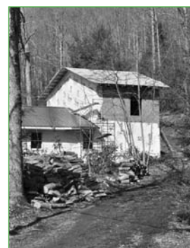
A second floor addition to Milan will provide 12 more beds.