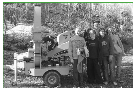
Baptist Campus Ministries' students on their spring break mission