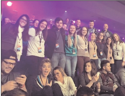
Marshall University students (standing) experiencing Passion 2016.

Several students from West Virginia attended Passion 2016; a conference for 18-25 year olds, where 40,000 people spread out among three venues and had an incredible worship experience. It was my first experience at Passion, but it will not be my last. I hope the West Virginia Baptist