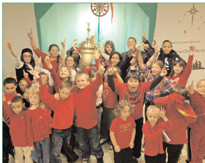
Weirton Christian Center kids celebrate winning first place in the commercial float category in the Weirton Christmas Parade. The center will be able to keep the large, traveling trophy for the next year.

Please be in prayer for the financial sustainability of the Weirton Christian Center. We are embarking in a new direction that has not yet been determined, but we feel God is connecting us with the right people to be able to accomplish more for His kingdom and provide sustainability for the ministry. We truly appreciate all the consistent support that has been given for the past 97 years by our West Virginia Baptist family. We need you more than ever as partners who will take us into our next century of doing God's business with “the least of these.”