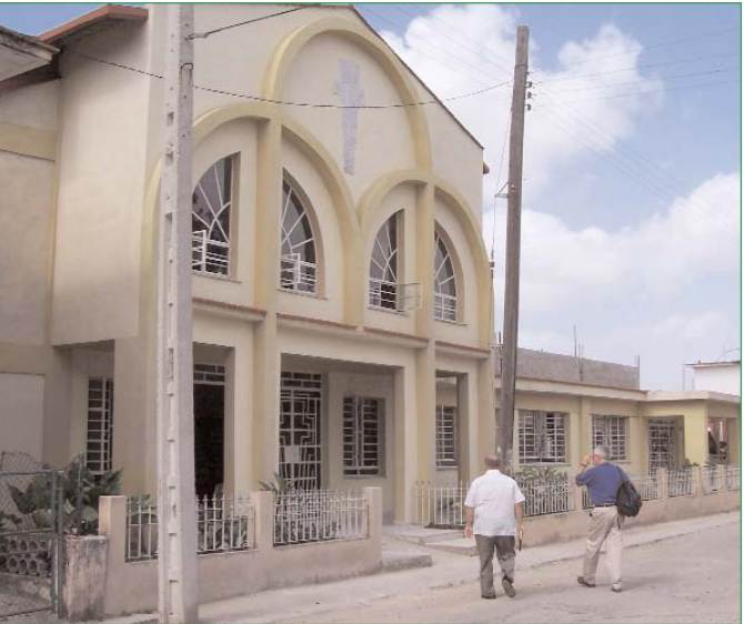
El Jordan Baptist Church, Havana, Cuba