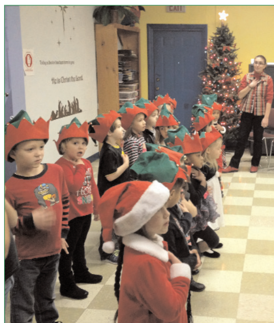
The preschool kids' program at Weirton Christian Center.