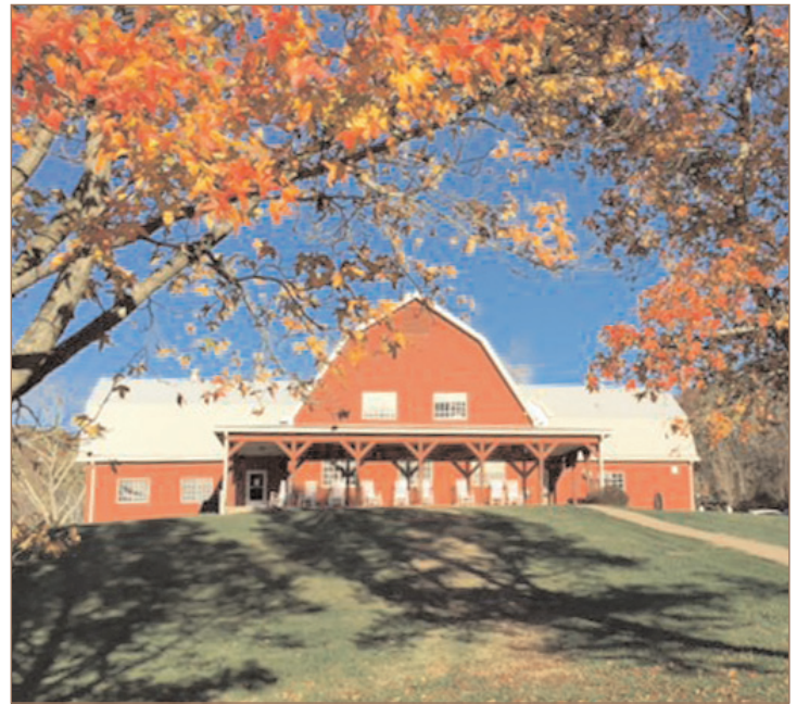
Parchment Valley Conference Center fall 2015

The American Baptist Women's Ministries have raised $12,000 for a Parchment Valley Conference Center truck.