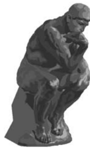
Rodin's The Thinker

This summer has been a season of positive challenges for our Baptist family. The Mission Conference at Green Lake, Wisconsin celebrated the wonderful call of God upon us to do missions around the world. The Transformed by the Spirit journey has begun around our national Baptist family. It is a journey that invites us to evaluate, review and amend our organizations as needed to take us into the future, using the adaptive change model of work that will enable us to find answers where there have been no clear-cut answers available, while balancing the autonomy and interdependence of the local church.