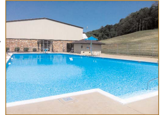
The beautiful pool at Parchment Valley Conference Center after much needed repairs.

Parchment Valley Conference Center is being blessed through the hard work of our outstanding and committed volunteers. Recently, our swimming pool underwent a major overhaul, including a new pool pump, concrete repair, caulking of all concrete expansion joints, beautiful tile, fresh paint and new pool restroom doors. Comfortable poolside lounges were added and the old bowling alley chairs were removed. Tom Stevens, pastor, New Hope Baptist Church (Parkersburg) and men from his church painted all the pool buildings. During the recent heat wave, the new upgrades at the pool have really provided a much needed cool spot for young and old alike.