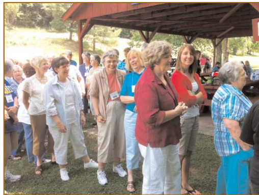
Ladies wait patiently in line to be served at the Donald Loudermilk Society picnic.