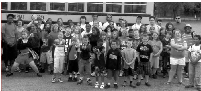
The Kennywood Park group

a day trip to Kennywood Park in Pittsburgh. Our big winner earned 500 points and there were two winners in each age group, since they were only five points apart! Six children were rewarded with $20 extra spending money for Kennywood from our quarters' fund! As we get ready for back to school, we are also ready for more Quarters for Grades . Thank you to all who continue to send those quarters in! This summer, the Hancock County School Board has granted us use of 20 of their Lexia Reading computer licenses to help the children improve their reading skills. We are eager to see the results of this wonderful program.