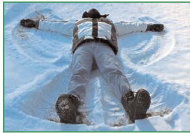
First-time snow experience