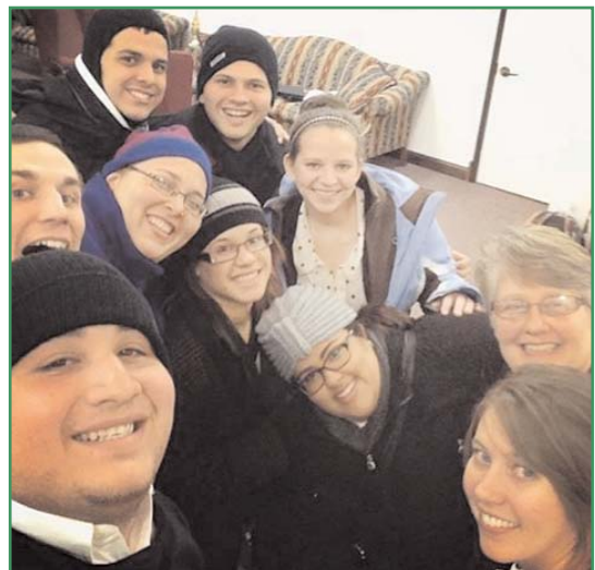
Project Hope Team

The mission of the West Virginia Baptist Convention is to empower local churches to be Christ honoring communities of faith and to help them fulfill their mission by enabling them to do together what they cannot do alone.