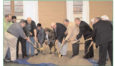
"Breaking ground" for the new Camp Ona cabin.