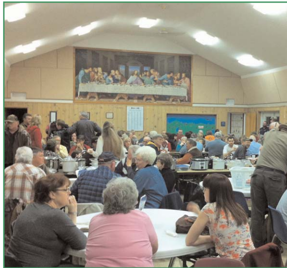
The crowd prepares to enjoy a feast at the Jackson County Second Annual Critter Dinner at Parchment Valley Conference Center.

Those Building for Generations donors have helped to roof buildings and make necessary repairs to our aging infrastructure. Without your support, we would not be able to properly maintain what God has so graciously provided for His people here. After the winter season, we are facing costly major repairs. We urgently need financial assistance to repair the dorms for our summer guest lodging and both Parchment Valley Conference Center vehicles are in need of being replaced.