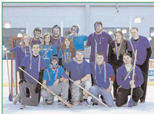
Baptist Campus Ministries' students participate in the semi-annual broom-ball tournament.