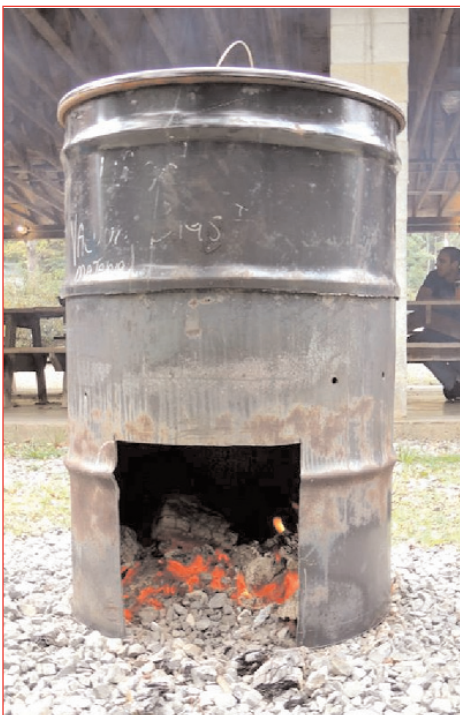
An oven constructed from a steel drum used to make "drum" bread.