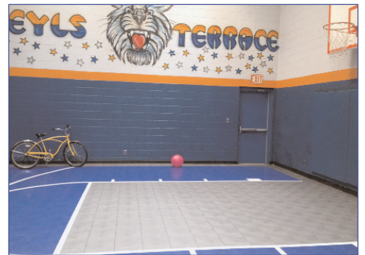
The new space also provides a recreation area.

The mission of the West Virginia Baptist Convention is to empower local churches to be Christ honoring communities of faith and to help them fulfill their mission by enabling them to do together what they cannot do alone.