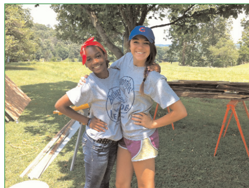
Making friends at Brothers' Keeper 2014.

When your Don Loudermilk Society membership is up for renewal, we pray you will continue your support. We thank the Lord for you and the lives you bless in aiding such a wonderful ministry at Parchment Valley Conference Center.