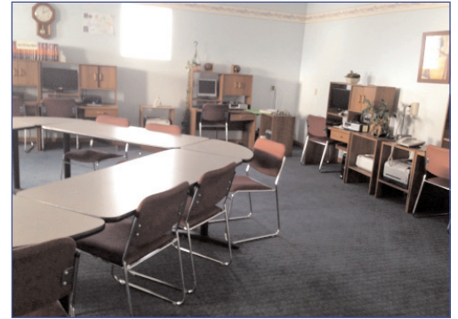
Classroom space inside the new building.

and God had a better plan for immediately solving our space problem. The new elementary school was bringing a bus of 50 children to the center at 2:20 p.m. and we were not sure how to handle them at our current facility. As part of our solution, we combined our preschool classes for three and four-year-old children. We also added a computer lab with an abc mouse to the program. This will split the class for the appropriate educational levels. Now we are able to keep K-2 students in the preschool and third and fourth graders upstairs. The middle and high school students are now in the larger facility. Buses bring them all from school, but we are transporting them all home and they are coming from all over the city. Our transportation costs are going to increase dramatically this year and we definitely will need more staff as we grow. God has expanded our territory and I know He has a plan for enabling us to serve Him in a big way. At the end of the school year, we will be talking about the future of the building we are holding the afterschool program in as well as a large gymnasium with much potential. Thank you for continued prayers and support as we continue to make a difference in the lives of these children.