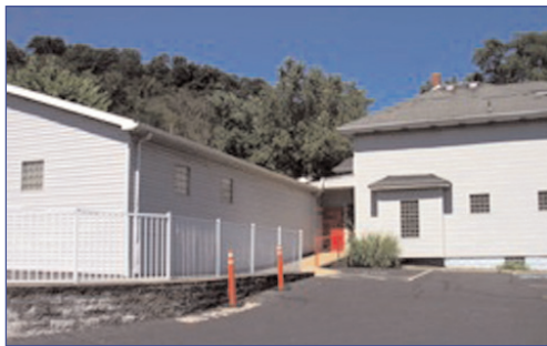
The Boys and Girls' Club building

In the spring, God answered our prayer for someone to help make a difference in the children's conduct. Tina