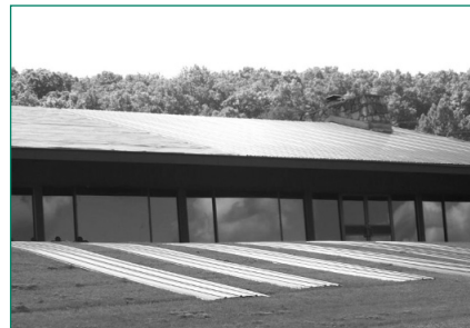
The Hill Hall roof at Parchment Valley Conference Center receives much needed repair.

The Building for Generations is a new Parchment Valley giving platform gaining rapid momentum, resulting in positive results. For example, the Hill Hall roof was in much need of repair.