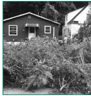
Stacks of brush cleared away by the Crossroads Community Chapel and Clearview Fellowship.

Crossroads Community Chapel (Teays Valley) and Clearview Fellowship (Greenbrier-Raleigh) spent a week in Pineville, June 16-21, 2013. In cooperation with Cook Memorial Baptist Church (Rockcastle), 25 youth and adults from the two churches came together to paint two houses, clear brush at one house and replace kitchen cabinets and a sink top at another. The youth from Cook Memorial hosted a youth get-together every night, complete with live music from Nick Joyce and challenging messages from Filip Vlastic, the youth director of