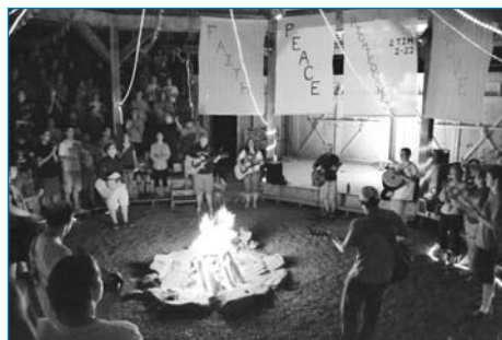
Camp Cowen Senior High campers join together in song at campfire.

figure out what we were going to do about Mid-High Camp. In the face of no power, limited communication and realizing this was a much bigger deal than a quick power outage, we cancelled camp for the next week. This was a big deal for me. In my 15 or more years of being involved with Camp Cowen, I never experienced a camp being cancelled. The next few days were an emotional roller coaster as power came on and went off; however, I learned God is faithful and present with His people in every circumstance. I heard stories and experienced first-hand neighbors helping neighbors, preparing meals, sharing air-conditioned homes, cutting trees and offering encouragement. We also were