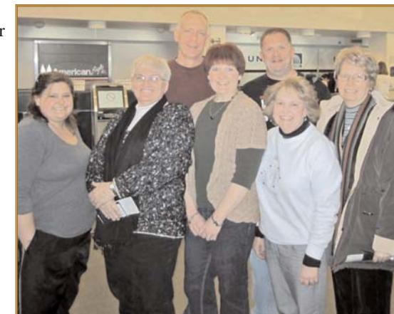
Representatives of five West Virginia Baptist churches led Biblical Peacemaking seminars for three churches in Russia.