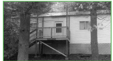
A porch has been added to the Broad Run (above) Association cabin.

Broad Run and Kanawha Valley Association cabins, installed new flooring in the Crouch Retreat Center, added bleachers at the campfire, put up ceiling fans on the Alice Randall Dining Hall porch and removed many dangerous trees to make things safer for the campers. Camp Cowen has once again been blessed by the service of the West Virginia Baptist Convention coming together to serve our God!