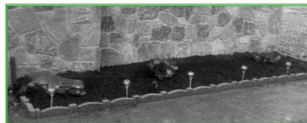
A new rose garden has been constructed at Hylbert Hall.

This construction has been made possible by many volunteers donating their time and talents. The American Baptist Men's work party of 2012 on May 4-5 was a great addition to the volunteer hours. During the rainy days at Camp Cowen, the volunteers helped construct a new rose garden at Hylbert Hall, built porches for the