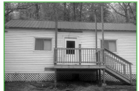
The Kanawha Valley (above) Association cabin has also received a new porch.

Camp Cowen...where people meet Jesus and grow as His disciples in a community of faith.